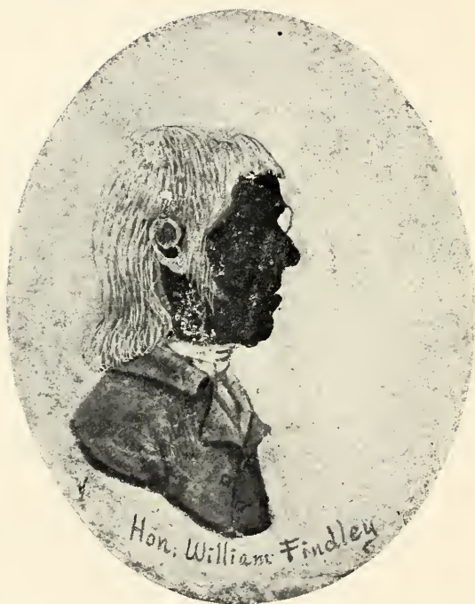
HON. WILLIAM FINDLEY