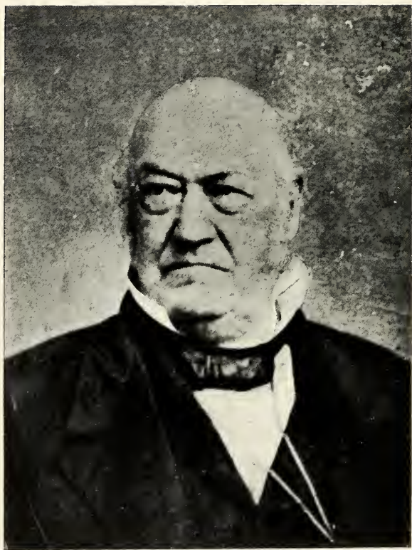
HON. THOMAS EWING