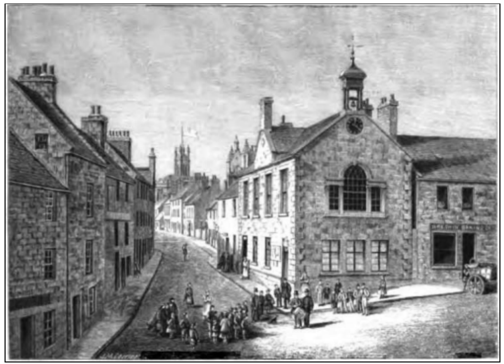
CHURCH STREET, HAVING MECHANICS' HALL IN THE DISTANCE

When this book was originally written in 1838, the Author was immersed in business, and could not bestow time on verifying all the statements in it by reference to authorities. He has now more leisure, and has employed it in examining every authority he could find bearing on the statements made. He cannot hope to be free from error; but he trusts this enlarged edition will be found to contain fewer mistakes than the previous publication. He meant to have quoted his authorities, and the manuscript was prepared with that view, but as it was found to be troublesome in the printing, and of little moment to the general reader, the references are only given in particular cases. The list of Bishops, however, in the Appendix, is supported by references to the authorities, warranting the insertion of their names in that compilation. The original publication was no source of emolument to the Author—the reverse; but it brought him the acquaintance of noblemen and of gentlemen, with whom he has had much pleasant intercourse. He has now and formerly been greatly indebted to many parties for hints and information; and while he feels it impossible to select particular individuals, he finds it would be tedious to give a list of the whole, and he therefore confines himself to tendering general thanks to his numerous friends, and to living authors from whom he has freely borrowed when he found anything in their works to answer his purpose, as some of them had borrowed from him previously.