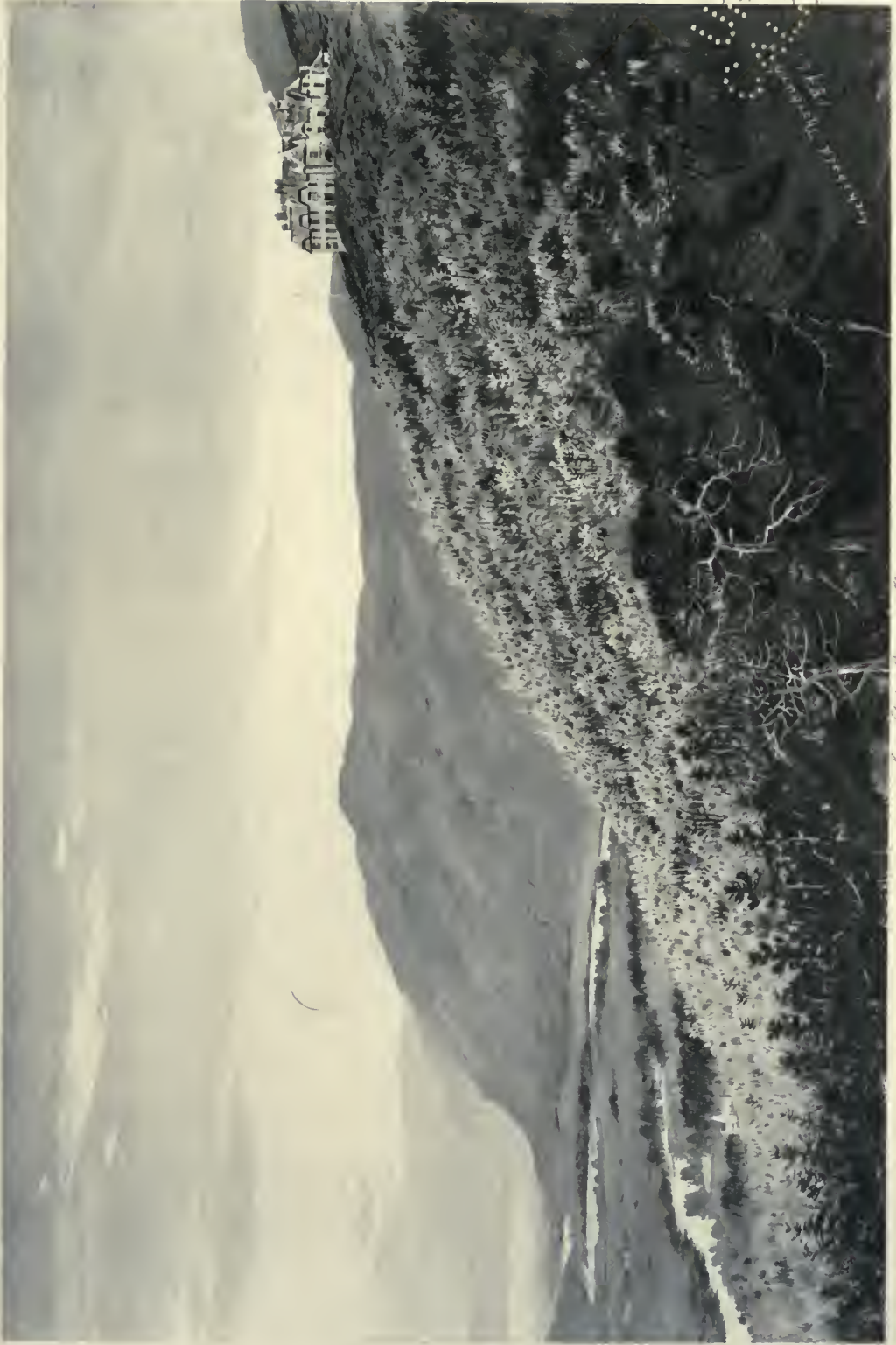
Queen Victoria Engineering Co.