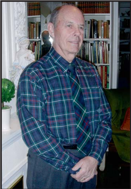
(Continued from page 5)