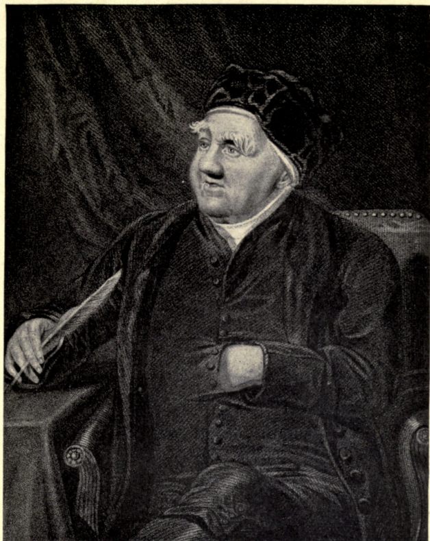
REV. SAMUEL PARR, LL.D.