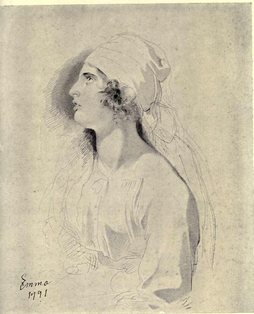
EMMA LADY HAMILTON.