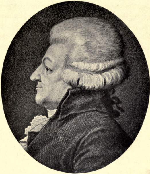
HONORÉ GABRIEL, CTE. DE MIRABEAU.