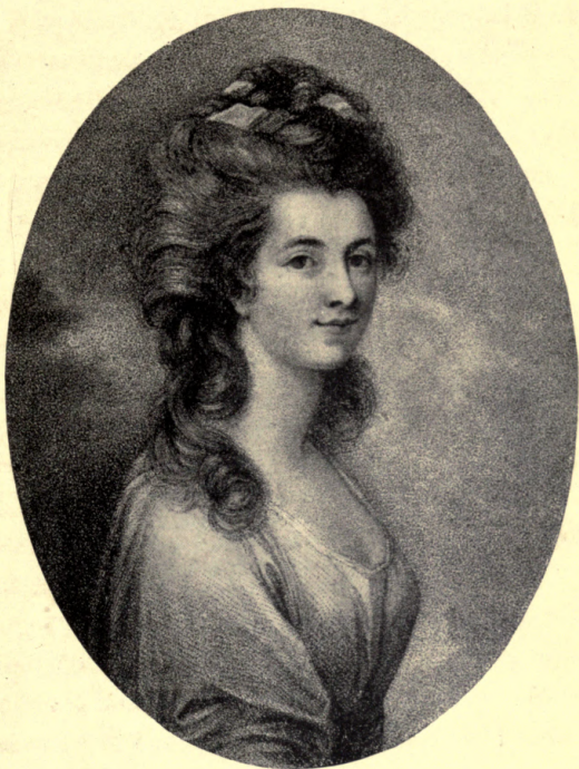
GEORGIANA, DUCHESS OF DEVONSHIRE.

From an engraving by Bartolozzi from the picture by J. Nixon.