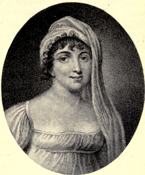
MADAME DE STAEL.