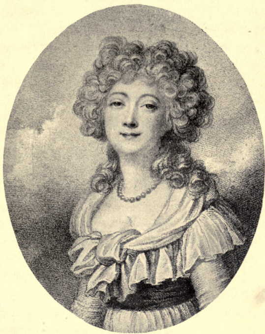
LA COMTESSE DU BARY.