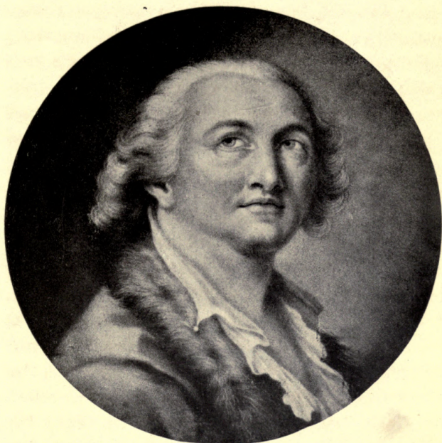
COMTE DE CAGLIOSTRO.