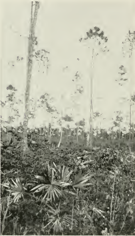
Pine woods and undergrowth. Great Bahama.

In some of the cuts appended, are shown the main types of vege-