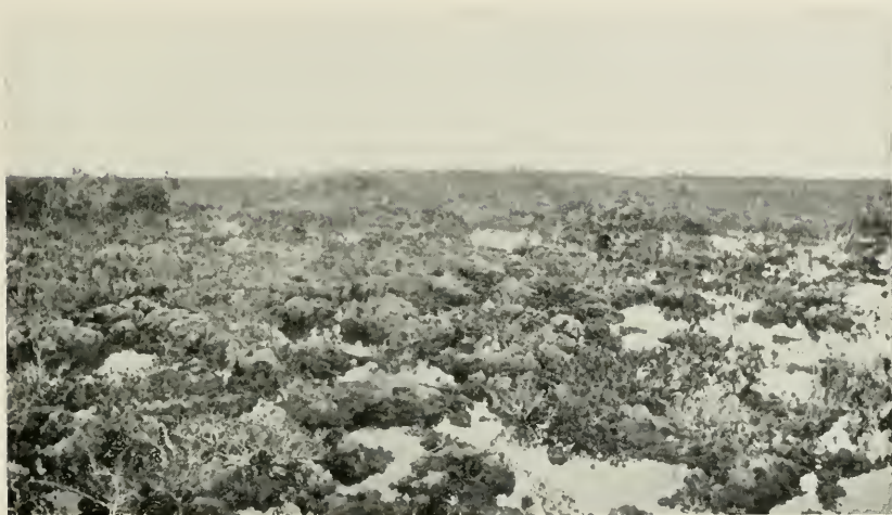
FIG. 1.—ERODED LIMESTONE ALONG SHORE. GREAT BAHAMA.