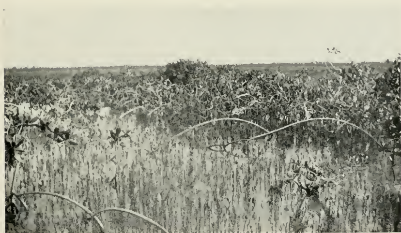
FIG. 2.—OUTER EDGE OF MANGROVE SWAMP. GREAT BAHAMA.