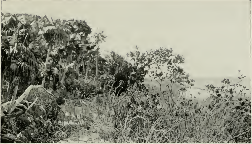
FIG. 3.—CAY VEGETATION. GREAT GUANA CAY.