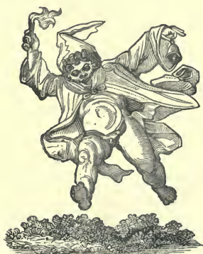
Alter et Idem.

PUBLICATIONS OF THE FOLK-LORE SOCIETY. I.