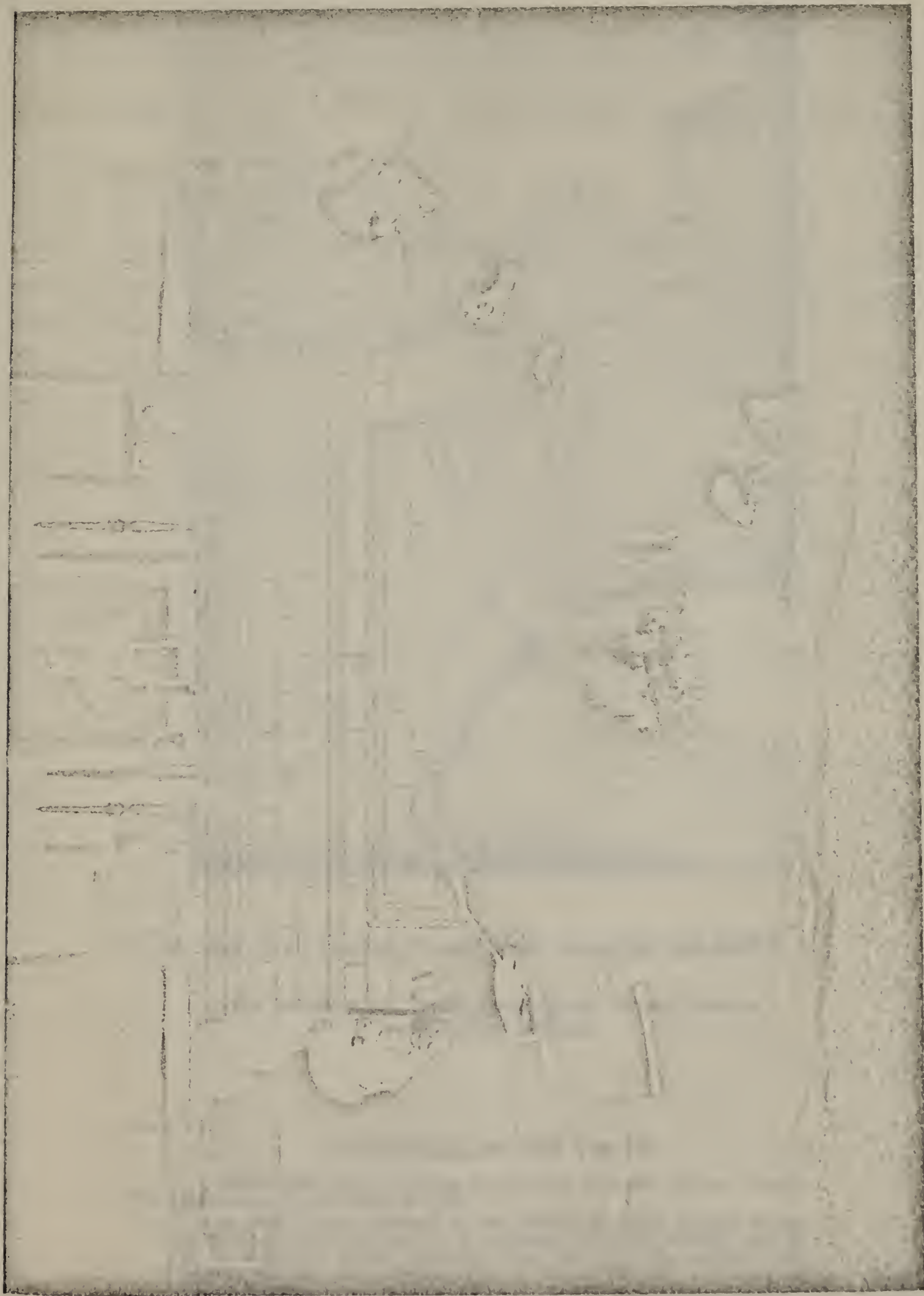
7 CHRISTMAS AT BONIVUE, 1934