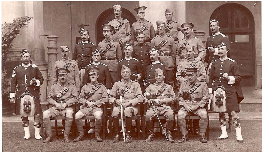
Photo above shows members of the Calcutta Scottish with members of the Calcutta Light Horse, circa 1916.

All corners of the globe have seen and heard, and in most cases benefited from their presence. Clan societies, pipe bands and even Scottish military units have been formed from Australia and South Africa, to Canada and even India. This month's Scottish military article is on a short lived, but rather interesting regiment in the Auxiliary Force, India: the Calcutta Scottish .