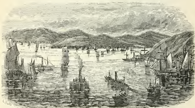
FRITH OF CLYDE.

veller for the pain of sea-sickness, by the splendour of a marine or inland landscape, it is here within the British dominions, where the changing horizon displays every variety of mountain scenery, and magnificent features of land and water in the freedom of range and distance, create in the mind an impression of transatlantic magnitude. I was particularly reminded, espe-