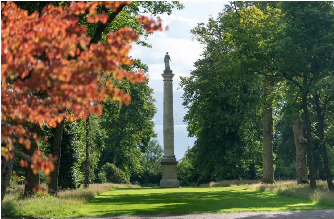
Monument to Augusta, Isle of Bute