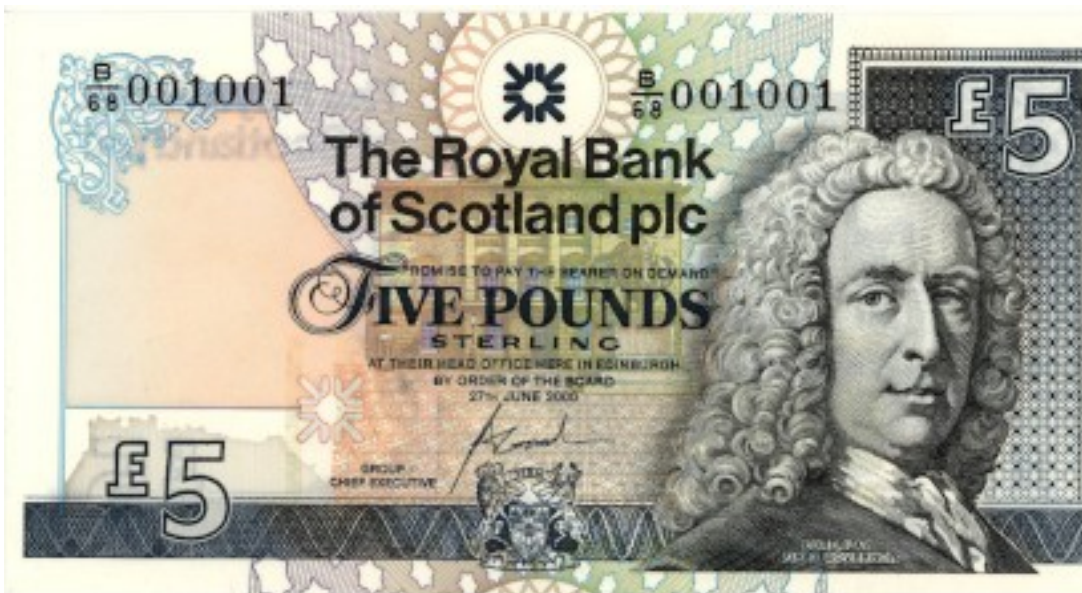
3rd Duke of Argyll