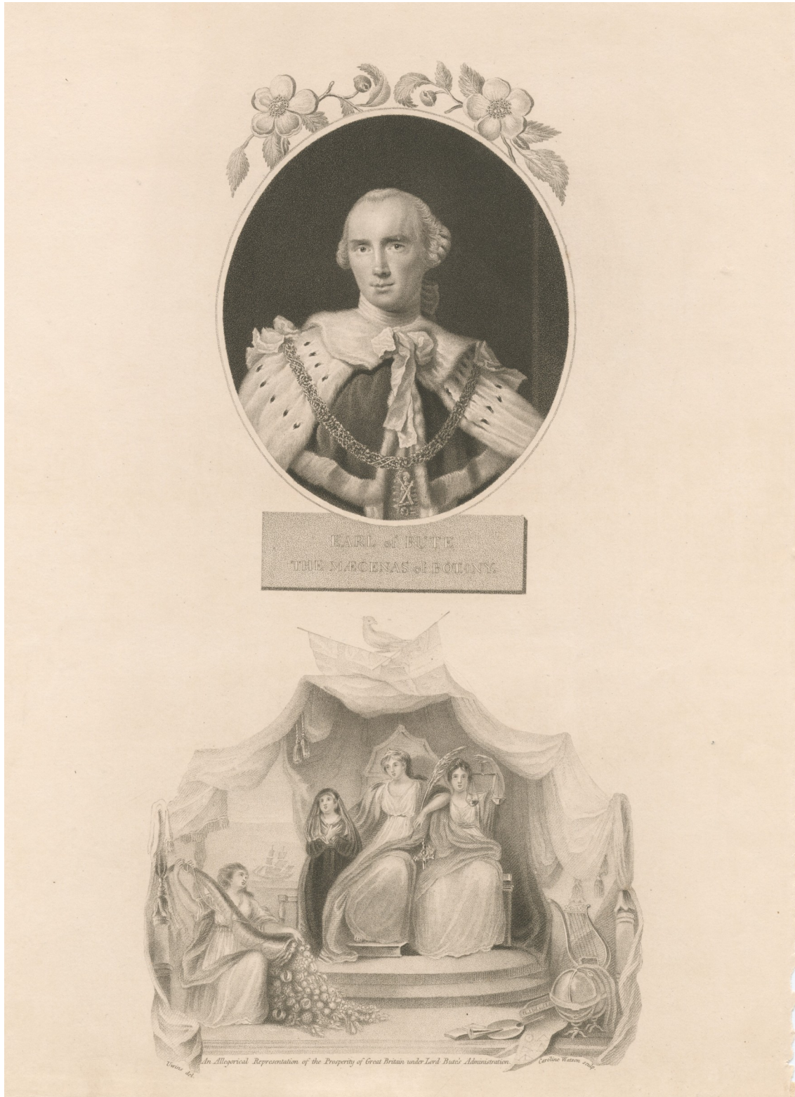
Earl of Bute, the Maecenas of botany