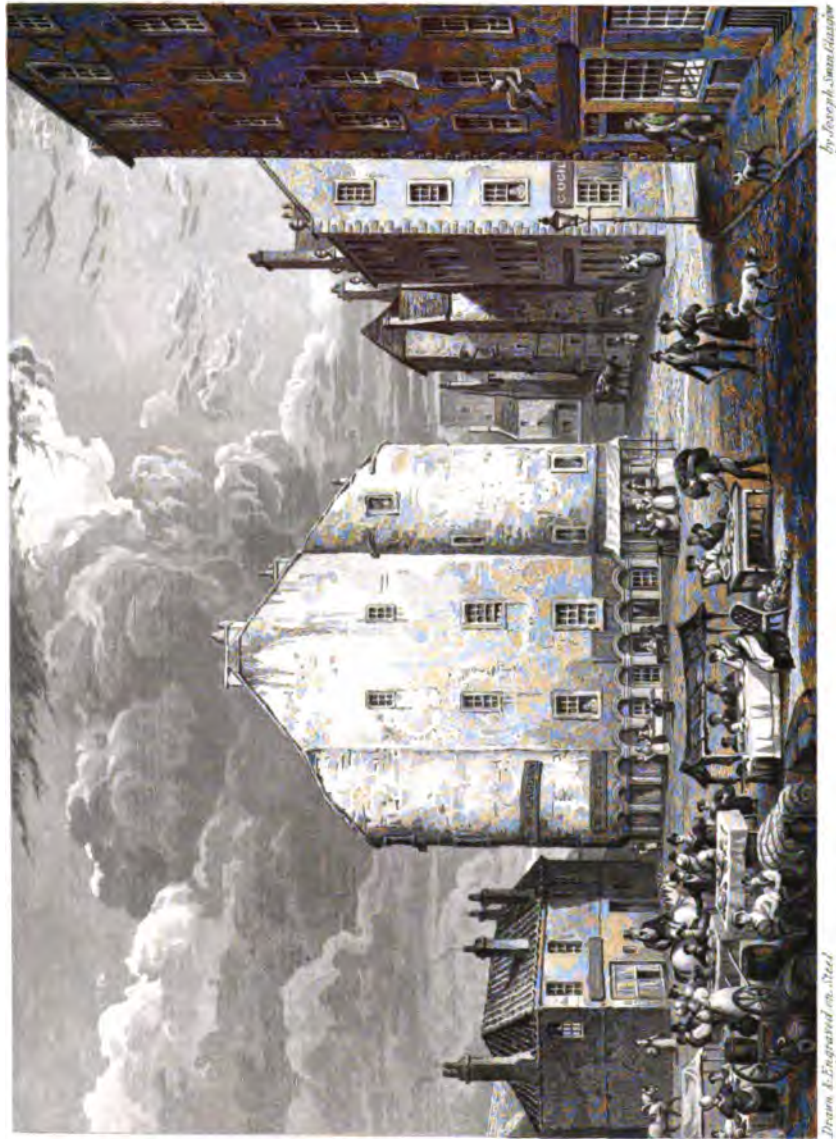
THE OLD CUSTOM HOUSE & FISH STREET