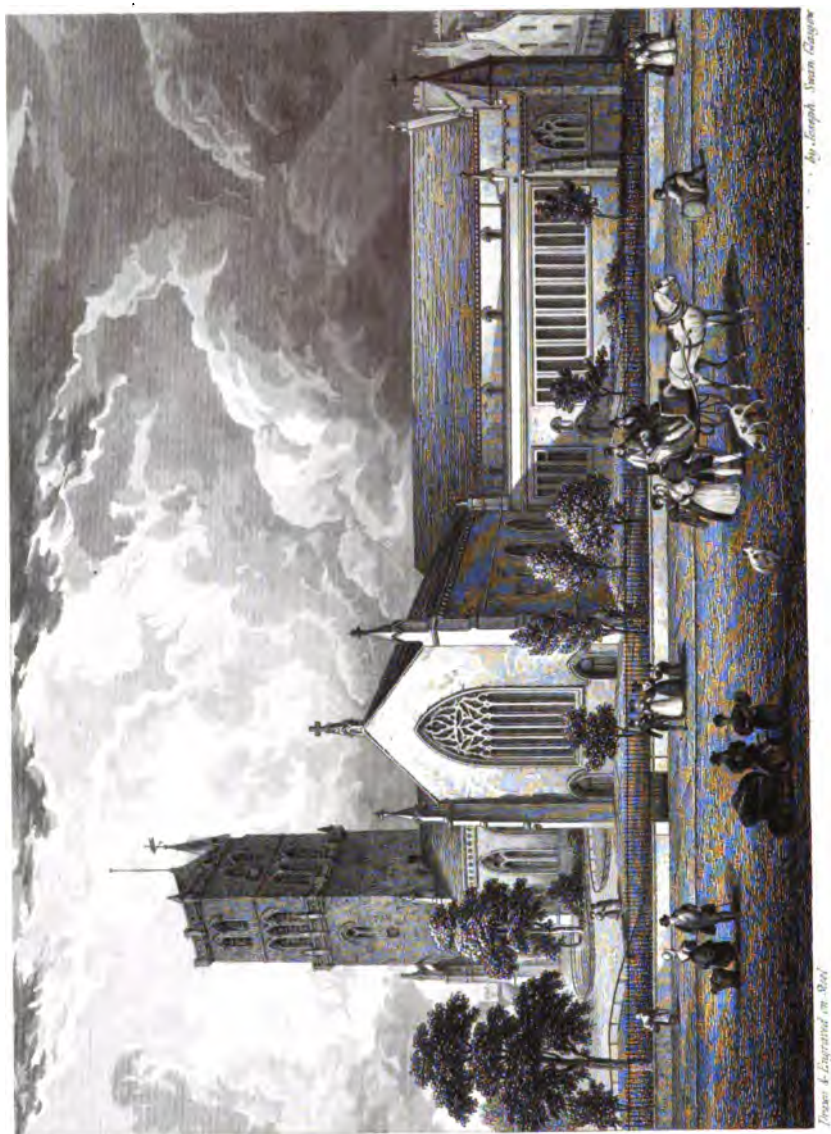
ANCIENT TOWER & CHURCHES