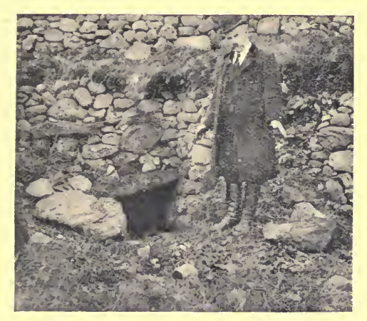
ARINABOST EARTH-HOUSE. DOORWAY AT A B IN GROUND-PLAN.

38 feet from beneath the porch of this house, under the road, and emerging into the remains of a roughly circular chamber, 7 feet in diameter, now laid bare in a gravel-pit.*