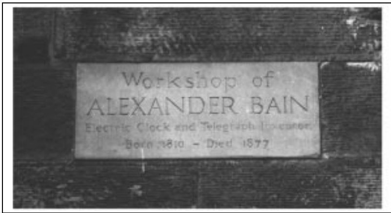
Figure 2. The plaque above the door that was ABain’s workshop in Edinburgh, probably between 1844 and 1847; it was then at 11 (now 21) Hanover Street. The plaque was unveiled in 1940, to celebrate the centenary of his invention of the electric clock.