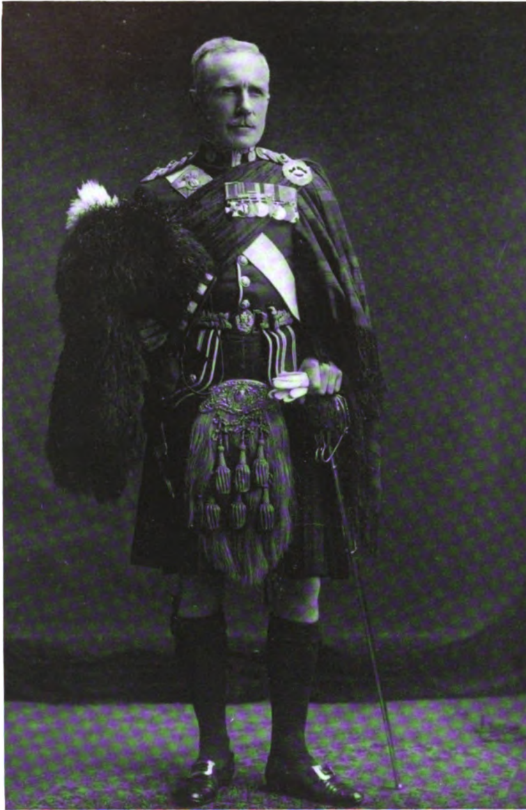
BRIGADIER-GENERAL E. CRAIG-BROWN, D.S.O.