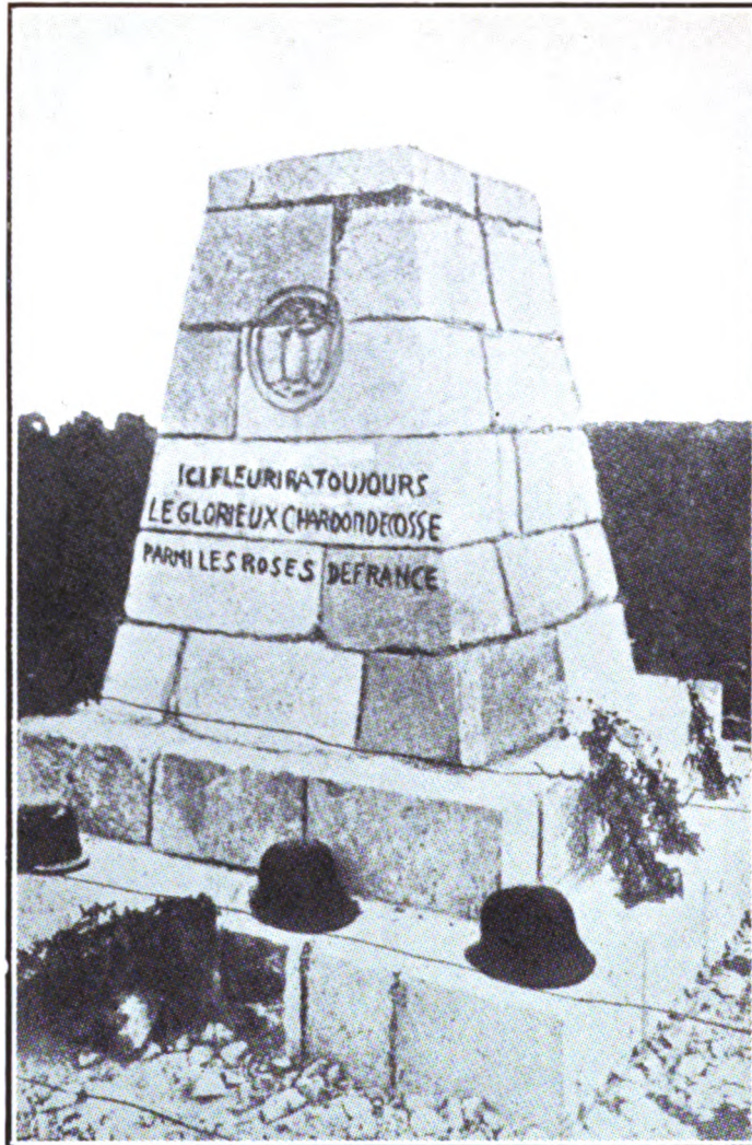
MEMORIAL ERECTED, NEAR BUZANCY, BY THE 17 TH FRENCH DIVISION TO THE 15 TH SCOTTISH DIVISION—JULY 1918.