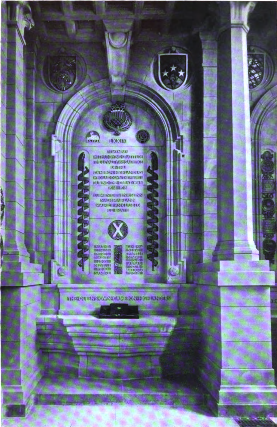
THE CAMERON HIGHLANDERS' BAY IN THE SCOTTISH NATIONAL WAR MEMORIAL, EDINBURGH CASTLE.