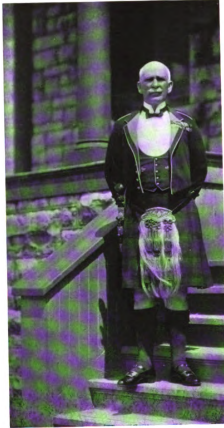
LIEUTENANT-GENERAL SIR ARCHIBALD CAMERON MACDONELL, K.C.B., C.M.G., D.S.O.