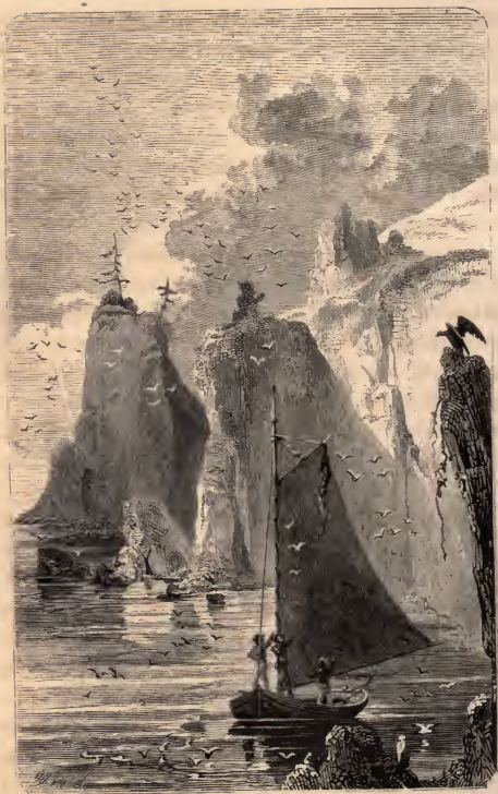
THE BLACK CRAIGS.