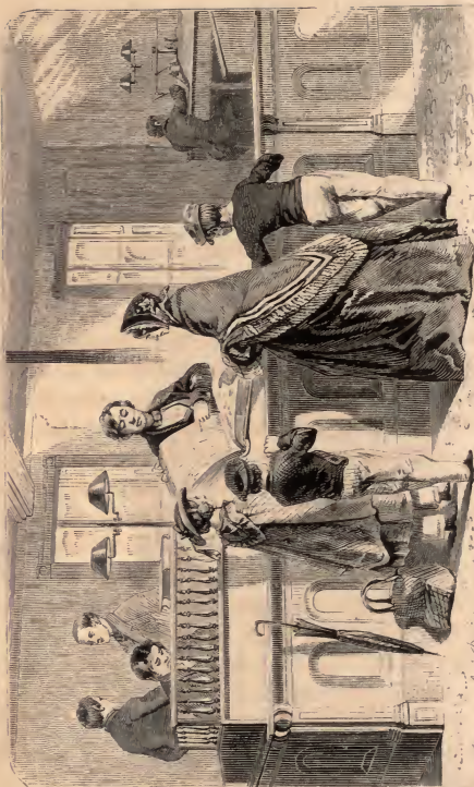
CHOOSING THE STATE ROOMS.