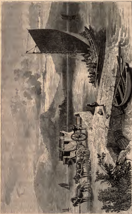
CROSSING THE MICKLE FERRY.