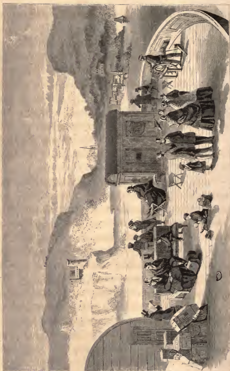
ON BOARD THE IONA.