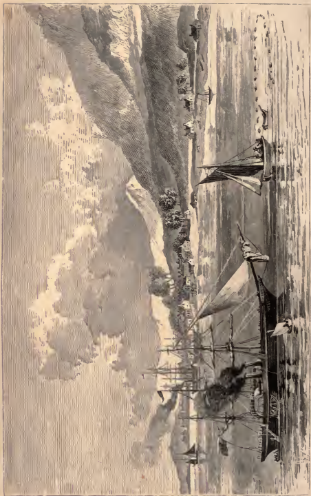
LANDING AT BEN NEVIS.