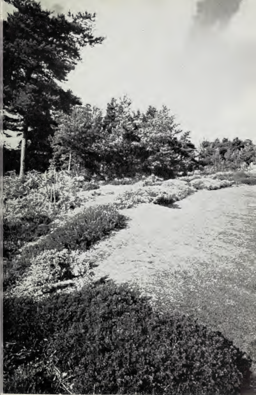
A Woodland Heather Garden in Dorset