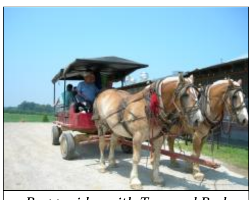
Buggy rides with Tom and Bud