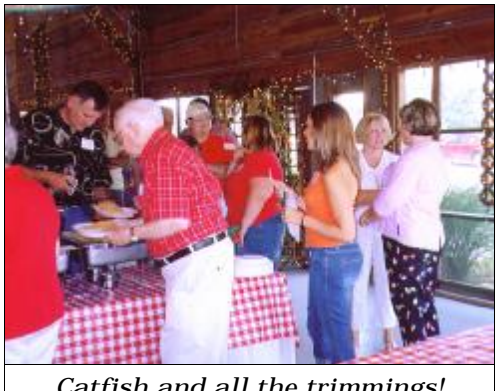
Catfish and all the trimmings!