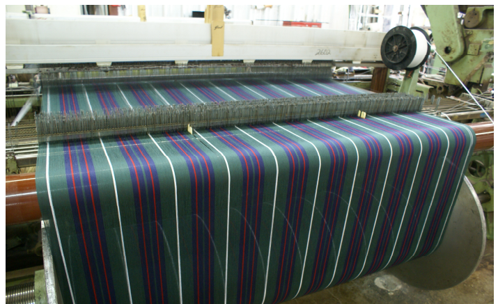
New tartan threads on loom in Blacksburg, South Carolina