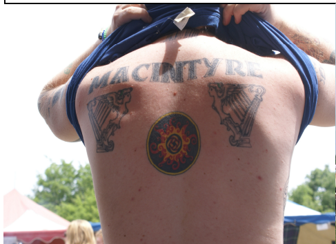
Extremes at Grandfather Mountain