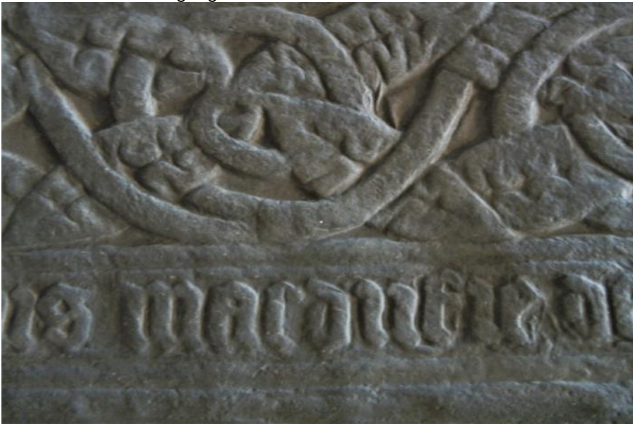
Section of Gave Slab: "MacDuffie" from 1539