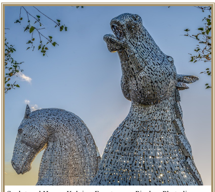
Sculptured Horses Kelpies: Free to use: Pixabay Photo license: https://pixabay.com/service/license/

Did you know that the Scots have a great affinity for horses? It is true. If you would like to learn more, check out these sites that I found: