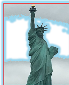
Statue of Liberty, New York Harbor