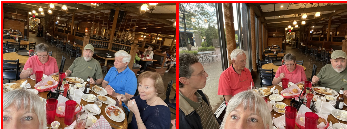
Some participants at KingFish Fundraiser.