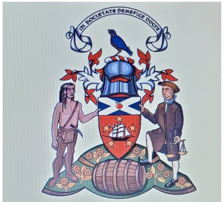
The St. Andrew's Society of the State of New York One more really nice coat of arms.