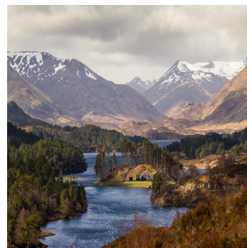
GLEN AFFRIC, SCOTLAND