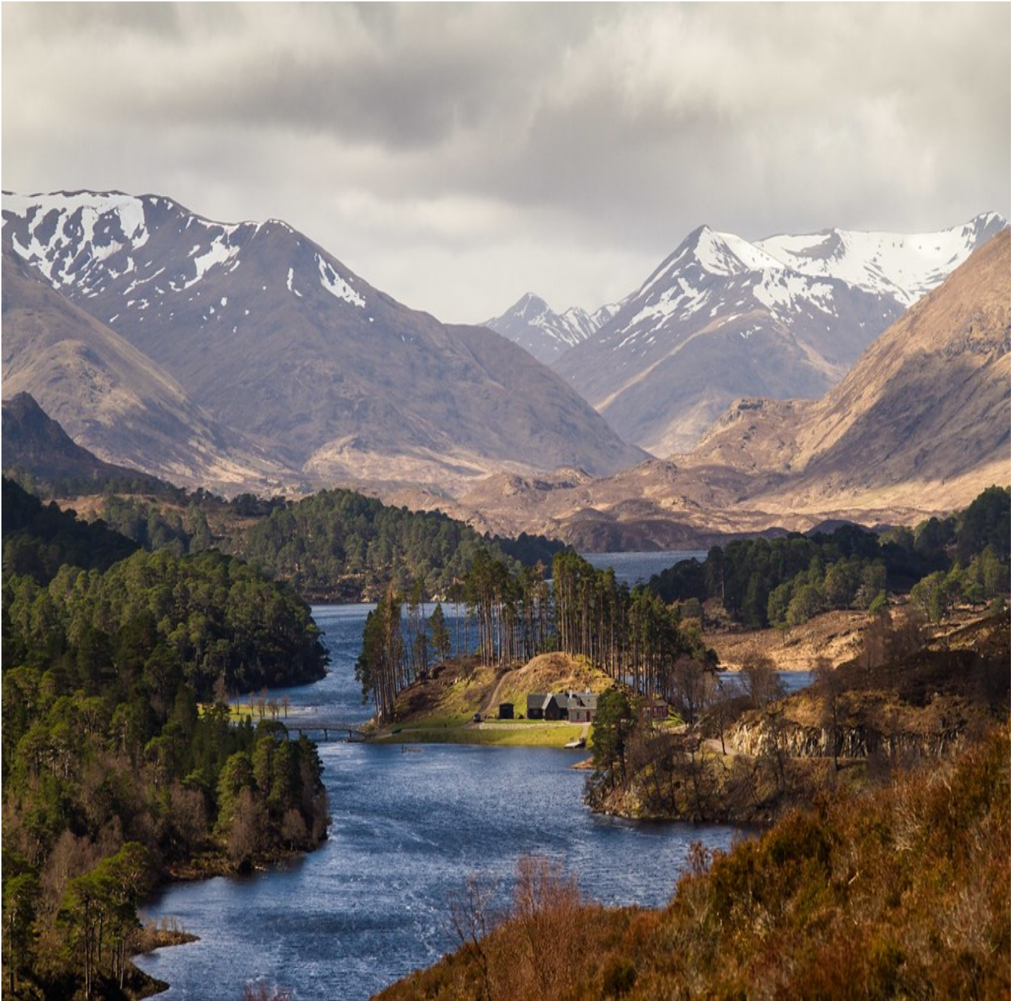
Glen Affric, Scotland