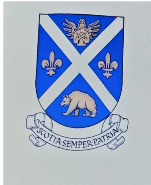
The St. Andrew's Society of Los Angeles, Inc. (1988)