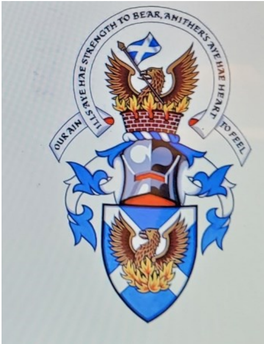
The St. Andrew's Society of San Francisco (1989)