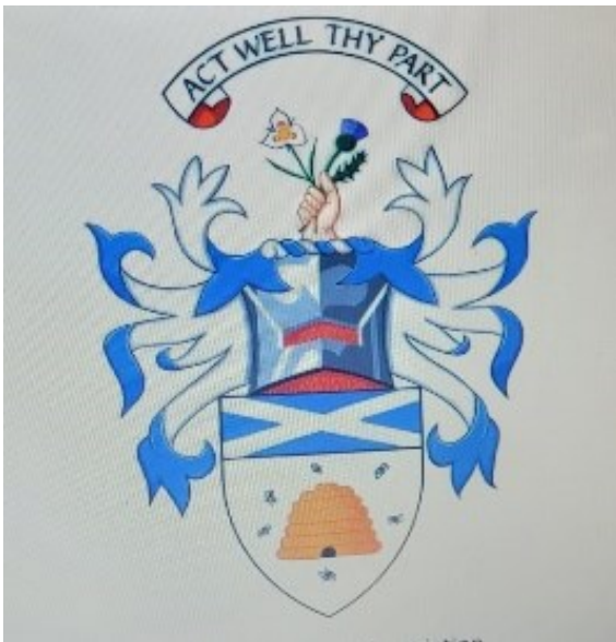
Utah Scottish Association Coat of Arms

The Lord Lyon showed us several pictures of various coats of arms. Here are a few.