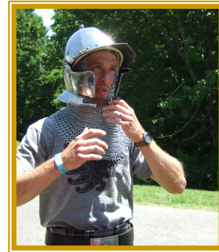
2017 Glasgow Highland Games