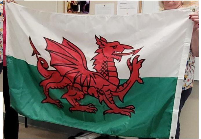
The Welsh flag