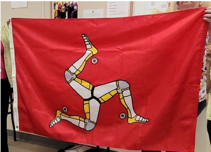
The Isle of Man flag