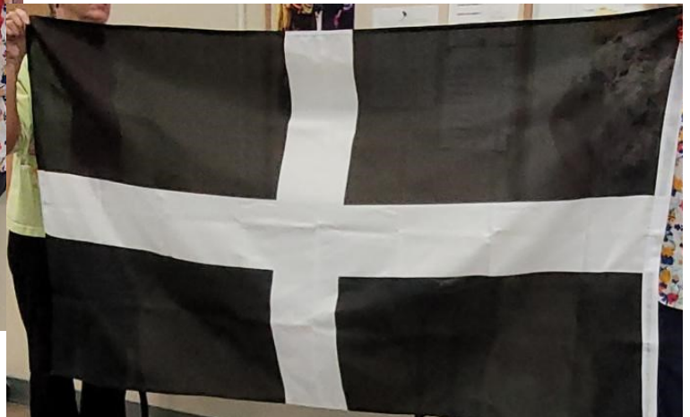
The flag of Cornwall