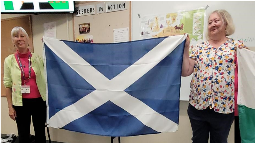
The Scottish Saltire