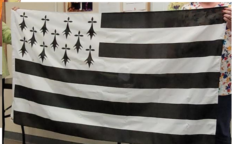
The flag of the Britons