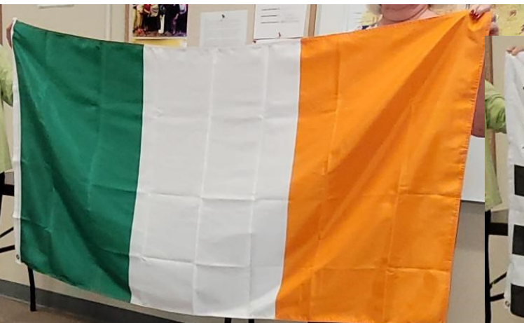
The Irish flag