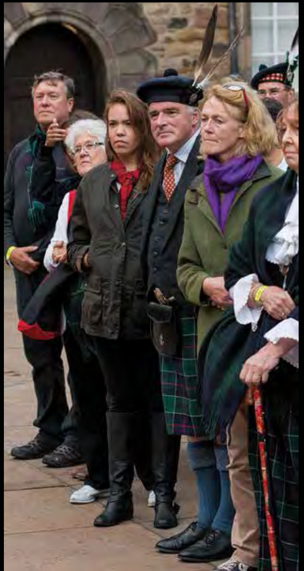
Member of Clan Leslie listen to instructions