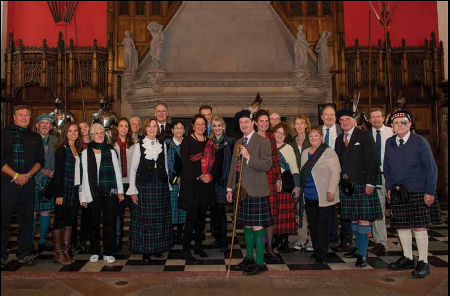
Clan Leslie in the Great Hall of Edinburgh Castle