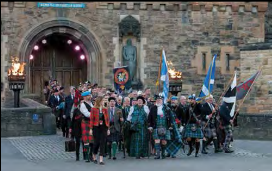
The clans are ready!