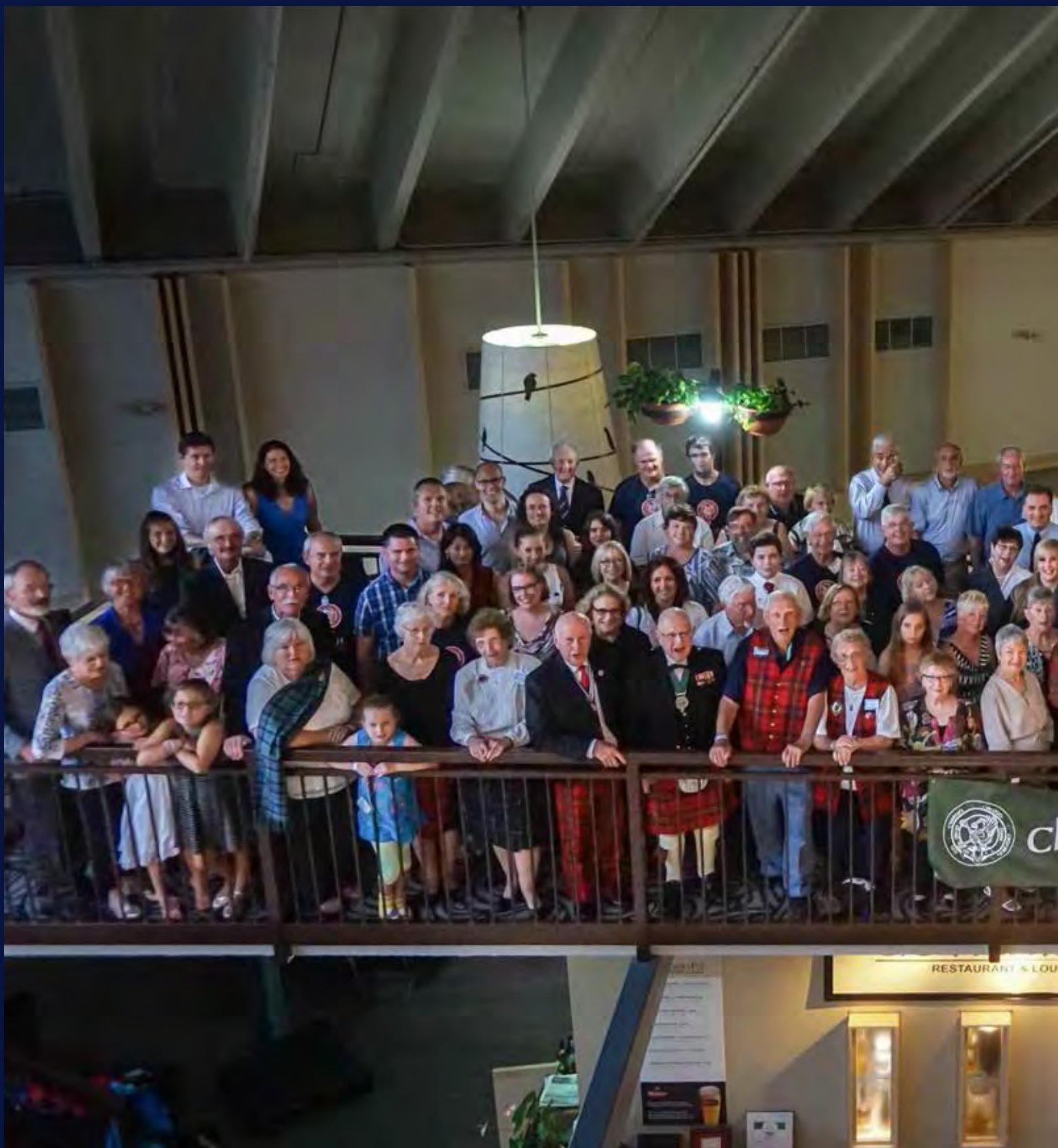
2016 CLSI Gathering,