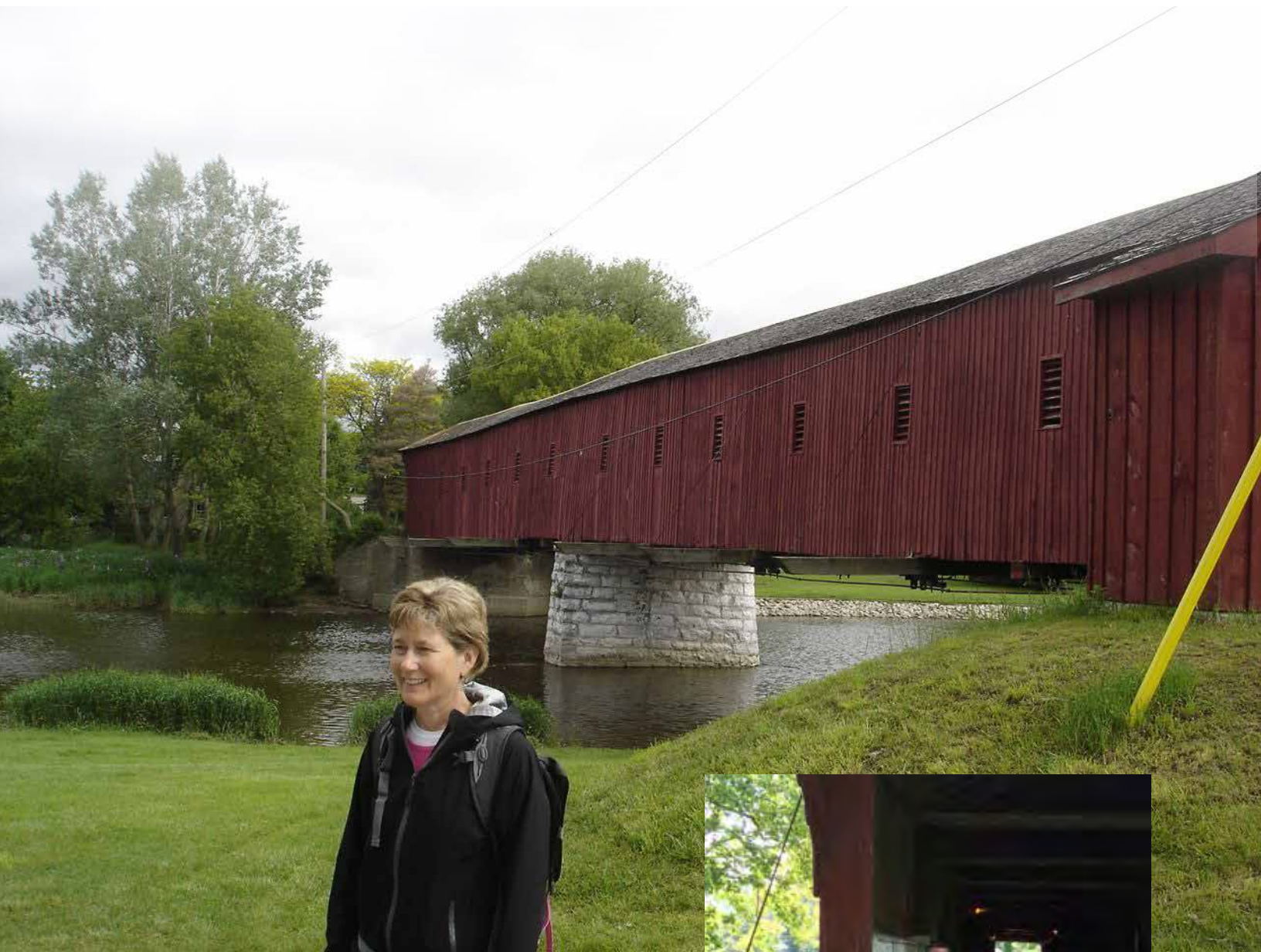
Above: The Mennonite Covered Bridge.