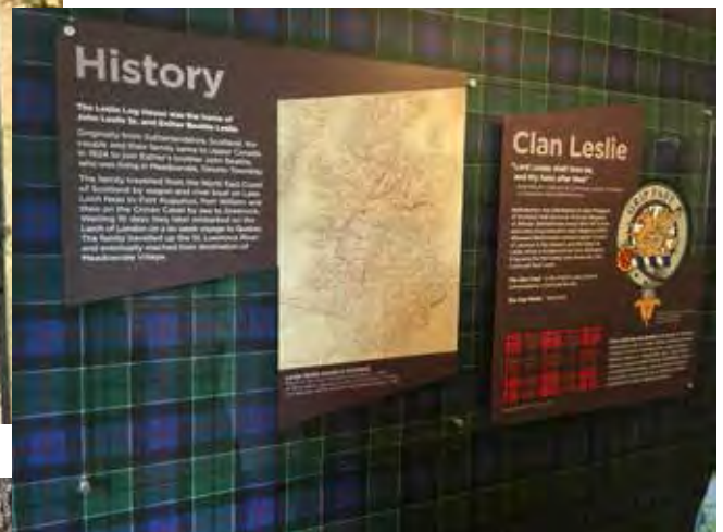
Below: The wonderful interpretive display at the Leslie Log House.