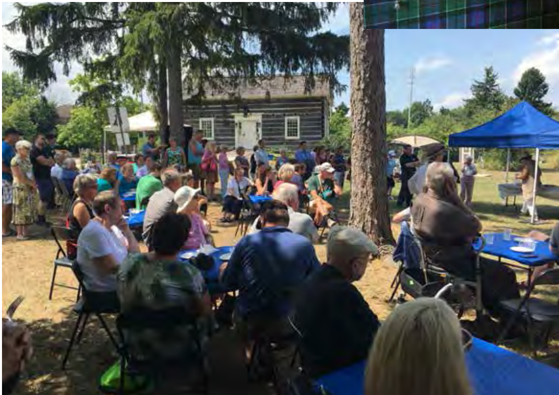
Left: A beautiful day for Leslies to gather at the Leslie Log House.