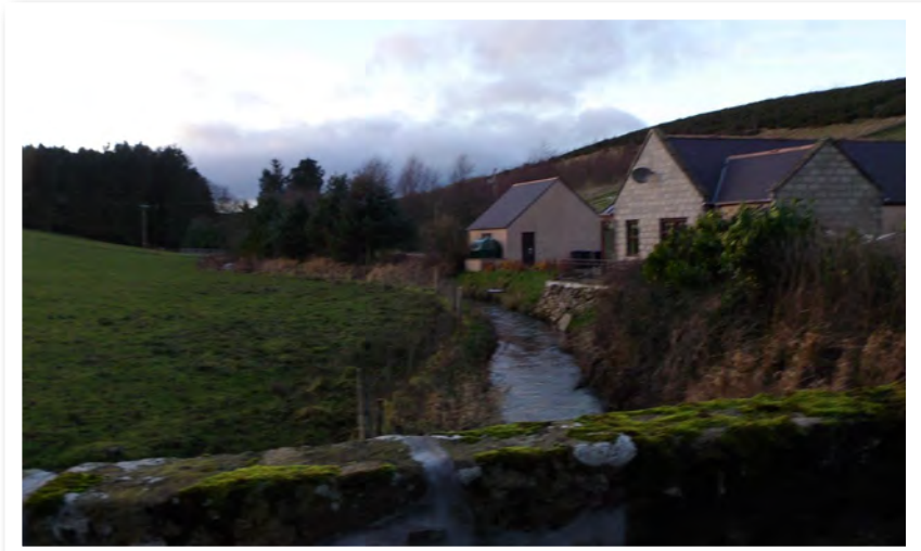
Upstream Gadie Burn From the Bridge of Leslie