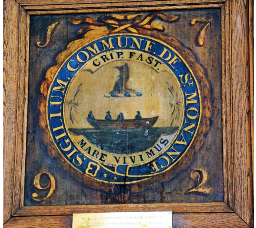
Plaque on the Wall of St. Monans

St. Monans Church, in close proximity to the shrine of the saint, was founded by Alan Durward about 1265-67. It is to King David II of Scotland, who reigned from 1329 to 1371, that we owe the building as it now is. The King seems to have conceived the church as a thank-offering to God, but there are two different stories about the particular occasion of his thankfulness. The first story tells how David was wounded by two arrows at the Battle of Neville's Cross in 1346 and how one of the arrows was extracted from the wound only after he had made a pilgrimage to the shrine of St. Monan, when the arrow leapt from the wound. The second story tells how the king sailed across the Forth to visit Ardrross Castle, and how the queen, Margaret of Logie, and he were in great peril when a storm arose. The king vowed that he would build a church to St. Monan if they reached the land safely.