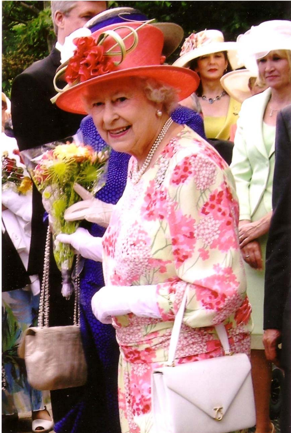
FRED LESLIE'S PHOTOGRAPH OF HER MAJESTY, QUEEN ELIZABETH II IN TORONTO