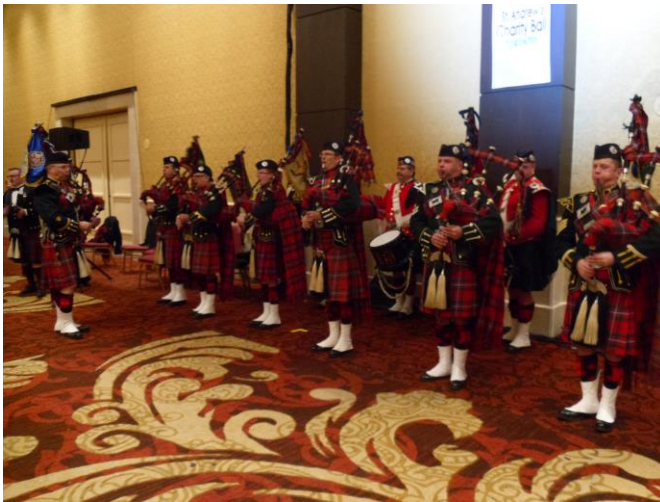
48 th . Highlanders Band playing for the Dancing