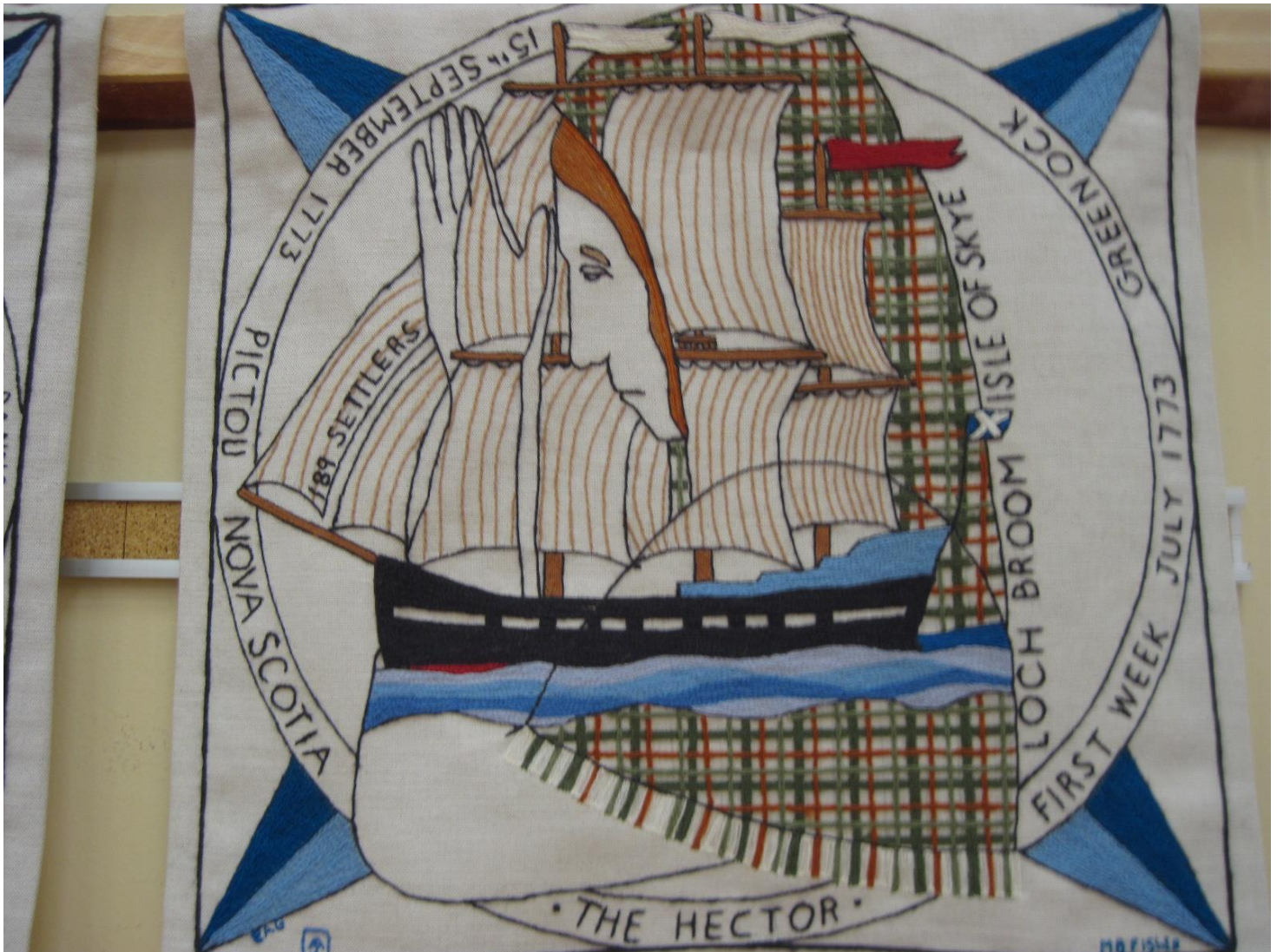
Scottish Settlers on The Ship Hector to Nova Scotia in 1773