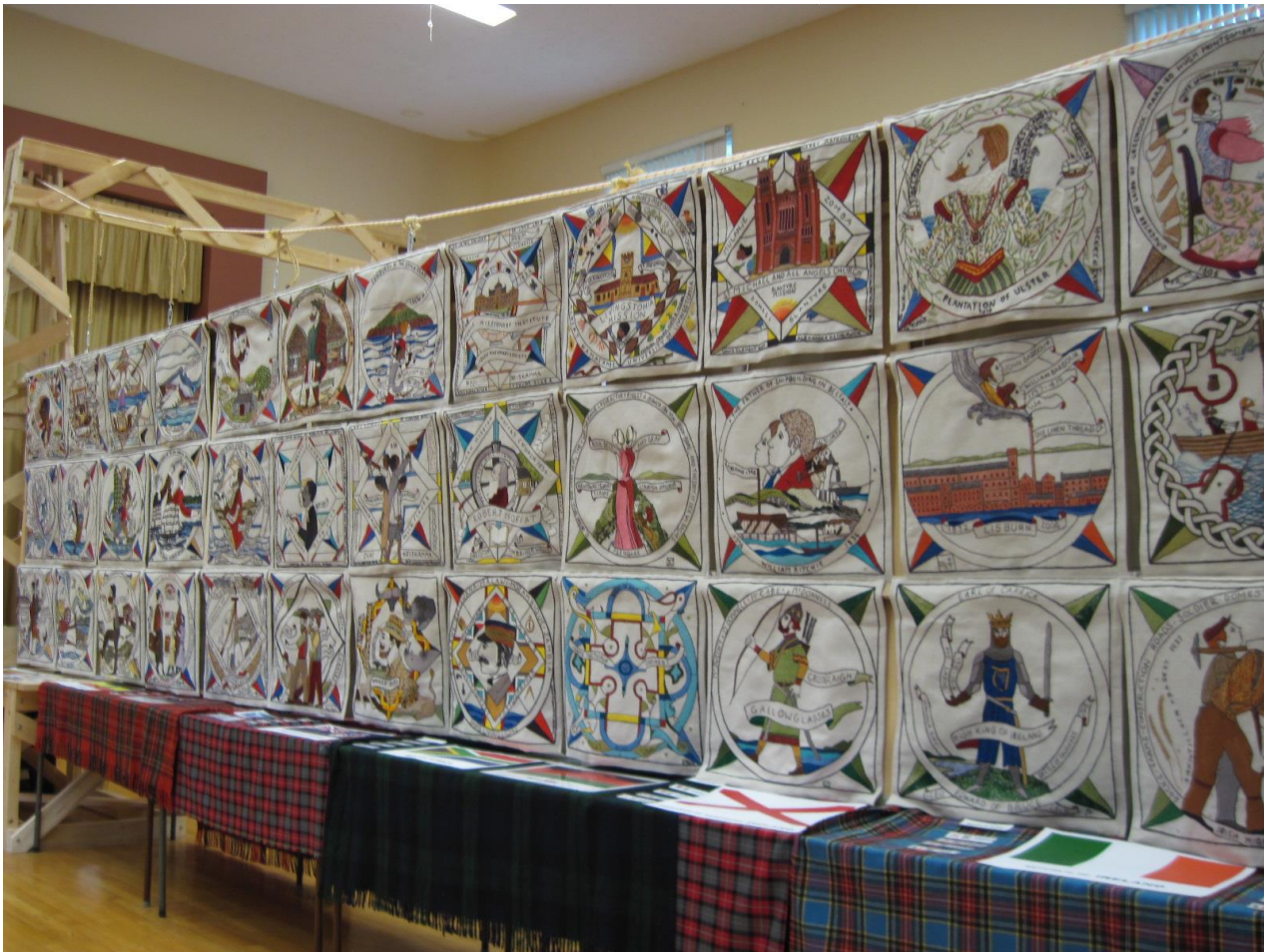
One of the Several Display Racks of Panels of the Diaspora Tapestry

Initially communities were identified in 25 countries to which Scots had emigrated. Groups of volunteers were approached to hand-stitch panels that documented their Scottish connections. By the end of the project panels were stitched by communities in 34 countries: Argentina, Australia, Antarctica, Brazil, Canada, Chile, China, Ethiopia, England, France, Germany, India, Italy, Ireland, Jamaica, Lithuania, Malawi, Netherlands, New Zealand, Northern Ireland, Norway, Pakistan, Palestine/Israel, Poland, Portugal, Russia, Sri Lanka, South Africa, Sweden, Taiwan, Tristan da Cunha, the United States of America and Zimbabwe. There was also a reverse diaspora, created to recognise the Italian and Asian communities who have settled in Scotland. Although people with a range of skills took part, it was estimated that it took at least 200 hours to stitch each panel.