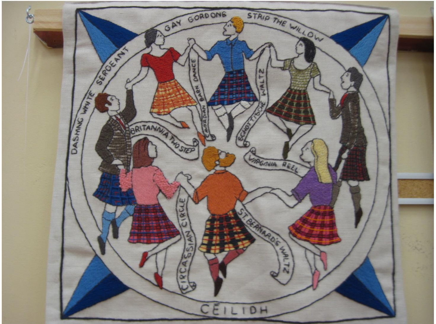
Scottish Country Dancing Panel – The Ceilidh

Work on the panels began in 2012. A version of the tapestry was exhibited across Scotland in 2014 for the Homecoming. The tapestry was displayed in locations around Western Europe the following year. November 2015 was the first time that all 305 panels were shown together. In 2016 the tapestry toured across Australia and Canada, and will return to London and Edinburgh in 2017.