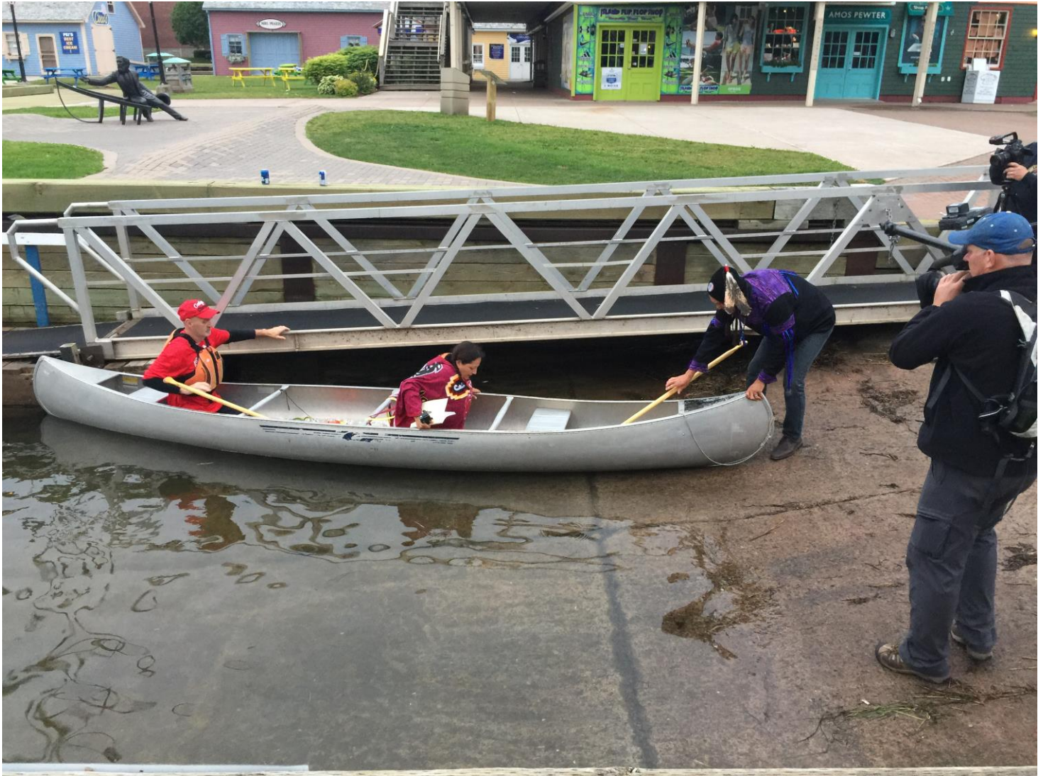
Mi'kmaq Chief arrives by canoe

A Sunrise Ceremony was held at 5:30 am at Confederation Landing, Charlottetown, Prince Edward Island, Canada. Photos show the Mi'kmaq chief arriving by canoe for a reconciliation meeting with Premier Wade MacLauchlan of P.E.I., to initiate a better start to the next 150 years. It was a very hopeful ceremony. We hope that everyone enjoyed a very happy Canada Day, on July 1 st !!!