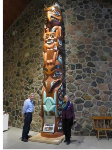
McMichael Art Gallery – Kleinburg, Ontario