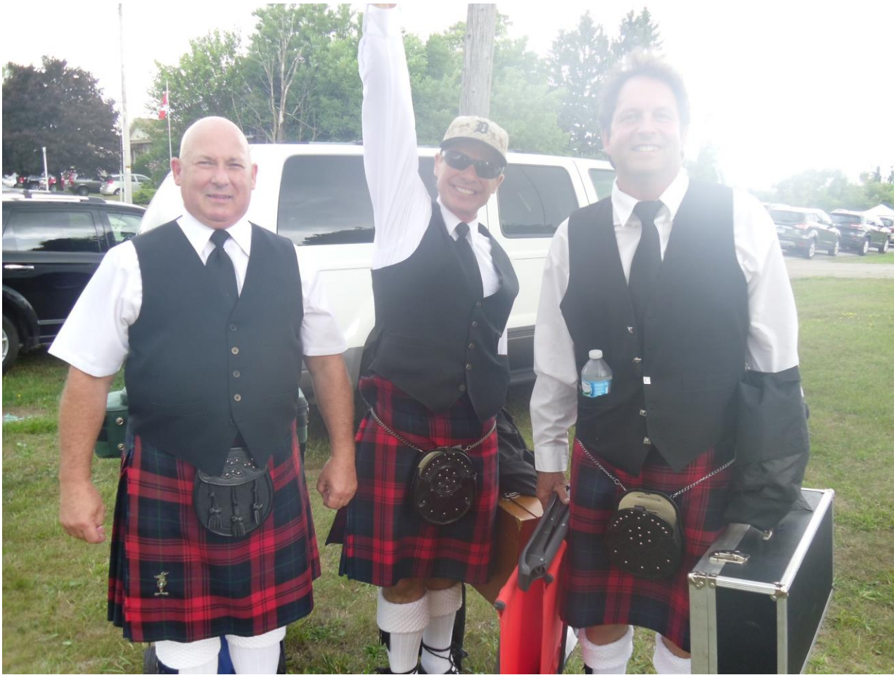
Three Members of the Border Cities Caledonian Pipe Band – Grade 4 Competition