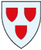
Clan Hay Shield: