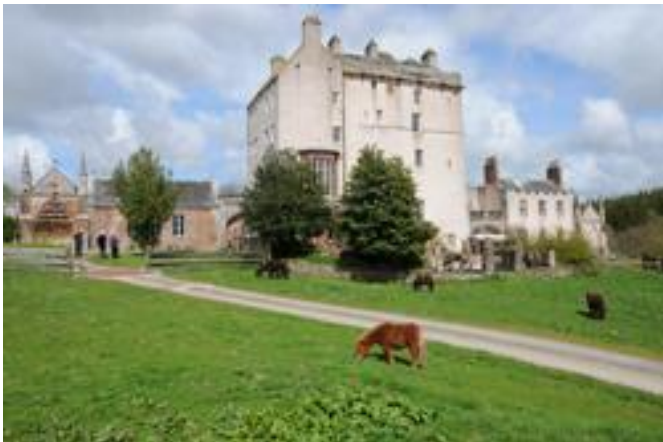
Delgatie Castle near Turriff, Clan Hay Centre