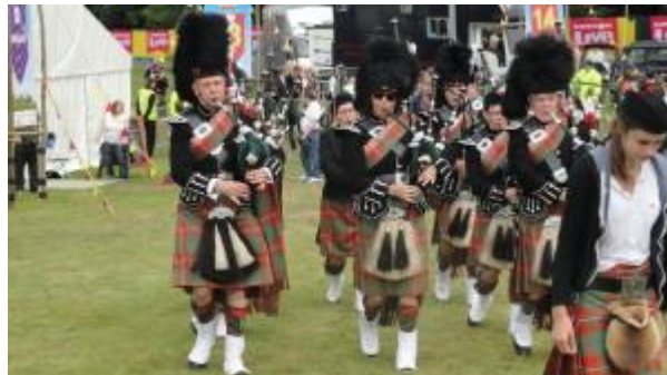
Clan Hay Pipe Band at Bannockburn