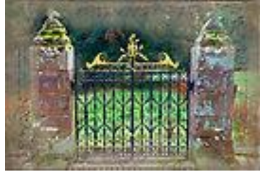
Delgatie Castle Back Gate