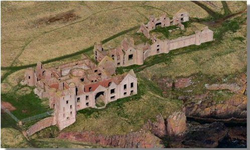
(Left -New Slains Castle remains)