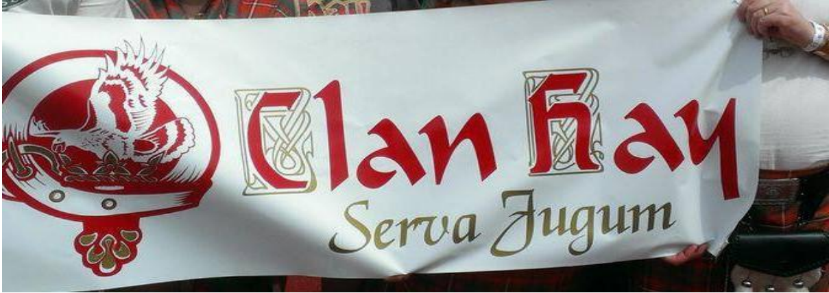
Clan Crest and moto: "Serva Jugum" ("Keep the Yoke")