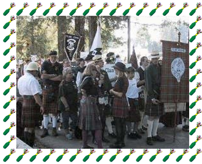
Clan Gregor leads the parade of Clans