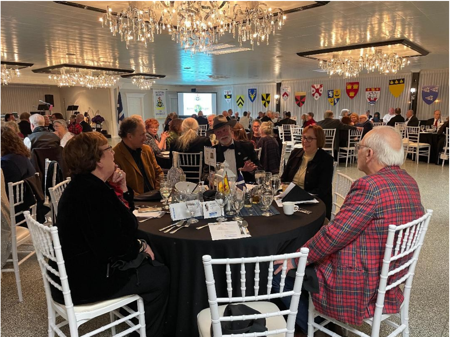
The Burns' Gala at Woodhaven Country Club from 2023