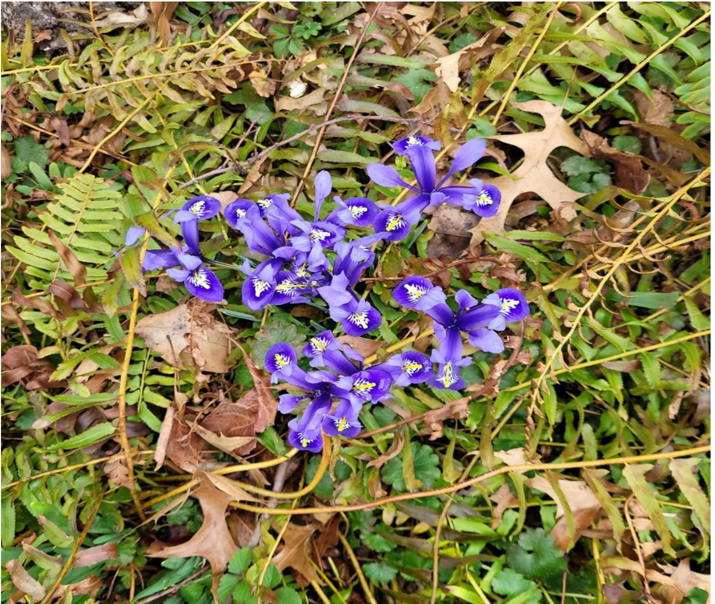
Spring Flowers.