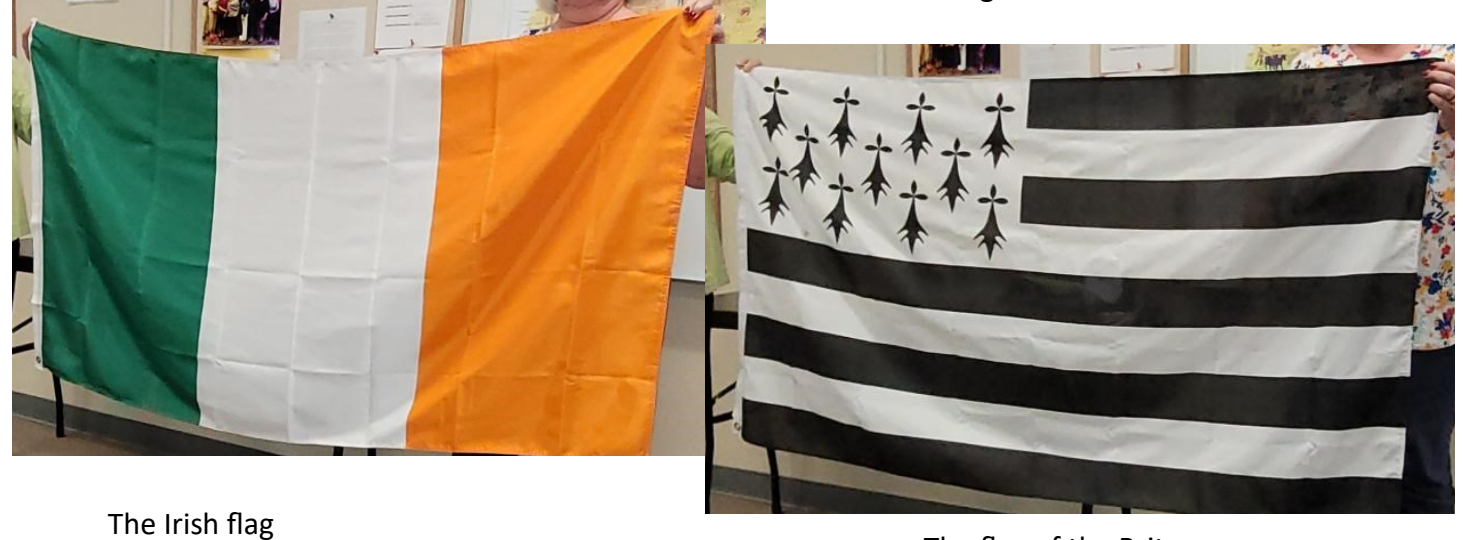
The flag of the Britons