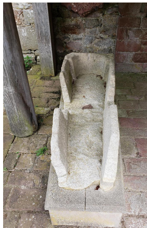
A stone coffin found in Deer Abbey. This is not the same stone coffin described in the legend but may represent what was used.

Whether this legend is accurate, or a creation of a later date, is irrelevant