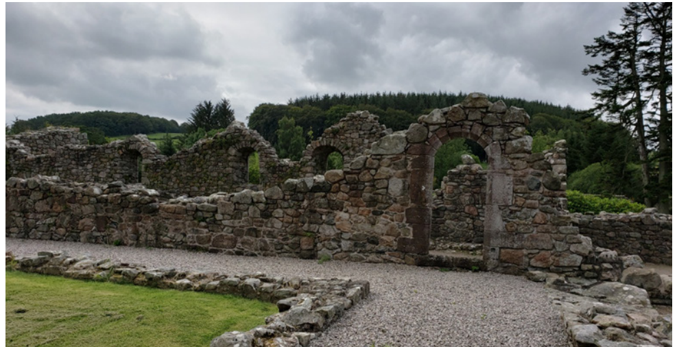
Fig 2. The ruins of Deer Abbey. This is the Cistercian abbey that succeeded the original abbey. The original Deer Abbey may have been built in a slightly different location

Several options have been floated from simply covering the ruins to developing a local run living history museum like the Crannog Centre.