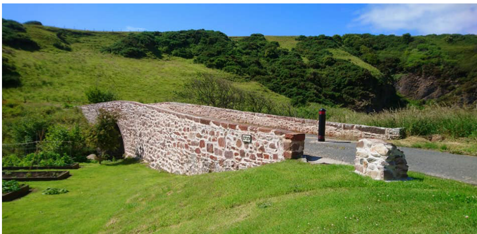
The new Cairn at Nethermill Bridge.