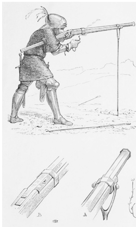
Depiction of an arquebus fired from a fork rest. Image produced in 1876.