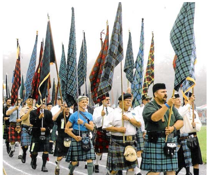
Baird Tartans in tartan parade at the Grandfather Mountain Highland Games