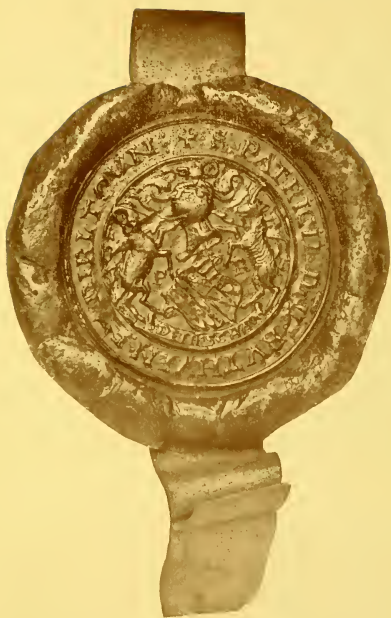
No. 2354. PATRICK, THIRD LORD RUTHVEN, A.D. 1561.