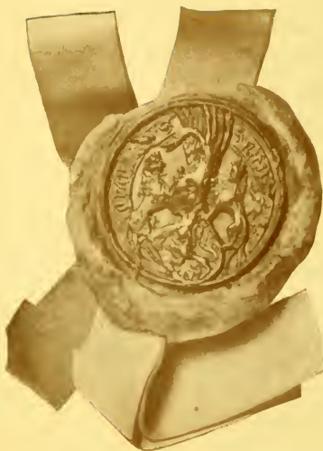
No. 1152. ANDREW GRAY OF FOPLIS, A.D. 1442.