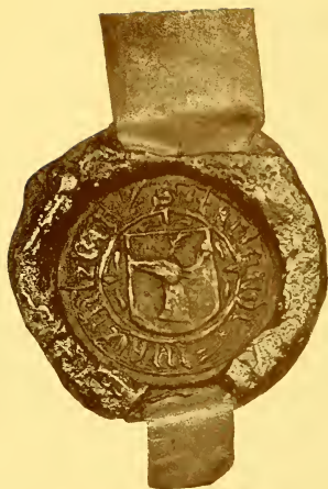
No. 1821. FARQUHAR MACGILLIVRAY OF DUNMAGLAS, A.D. 1549.