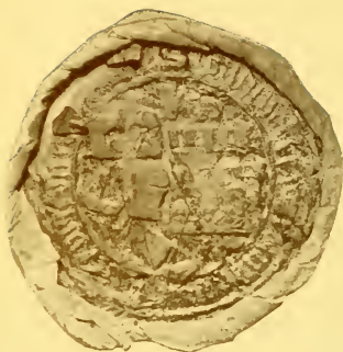
NO. 1840. HECTOR MACLEAN OF DOWART, A.D. 1546.