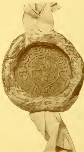
No. 1828. JAMES MACKINTOSH, A.D. 1568.