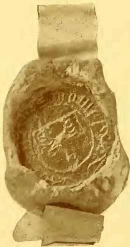
No. 1812. THOMAS EWYNESONE, A.D. 1539.