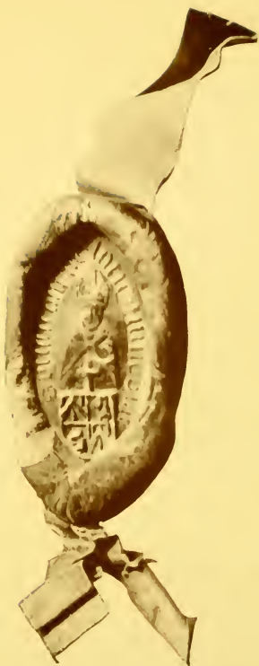
No. 960. ARCHBISHOP ANDREW FORMAN, A.D. 1517.