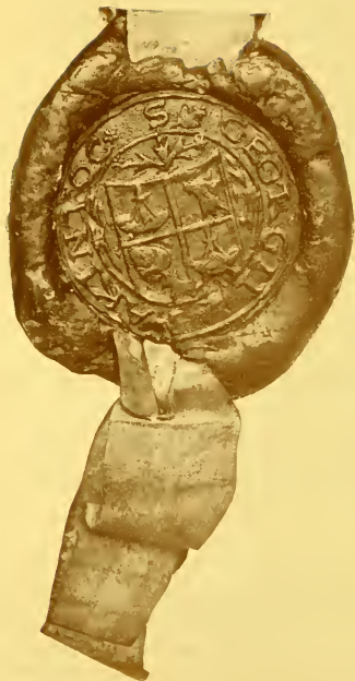
No. 1829. GEORGE MACKINTOSH IN BALLARNAT. A.D. 1599.