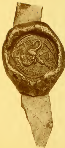
NO. 2657. JAMES STEWART, CONSTABLE OF SPYNIE, A.D. 1475.