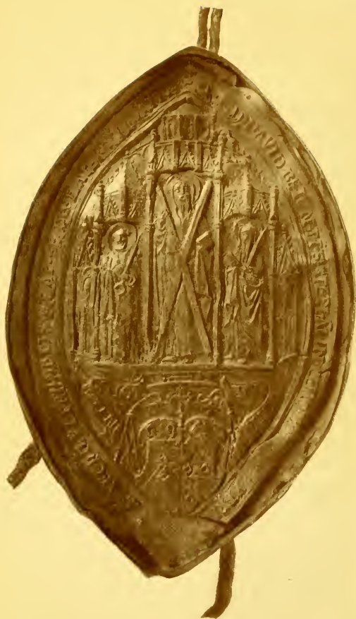
No. 139. CARDINAL DAVID BEATON, A.D. 1545.