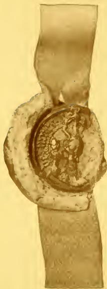
NO. 2061. SIR DAVID MURRAY OF TULLIBARDIN, A.D. 1442.