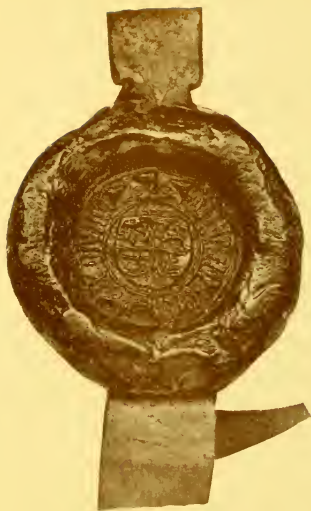
No. 1825. WILLIAM MACKINTOSH OF DUNACHTON, c. A.D. 1505.