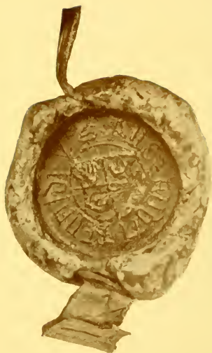
No. 1803. ALEXANDER MACDONALD OF KEPPOCH. A.D. 1548.