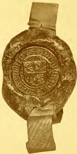
No. 1824. FARQUHAR MACKINTOSH OF KEPPOCH, A.D. 1505.