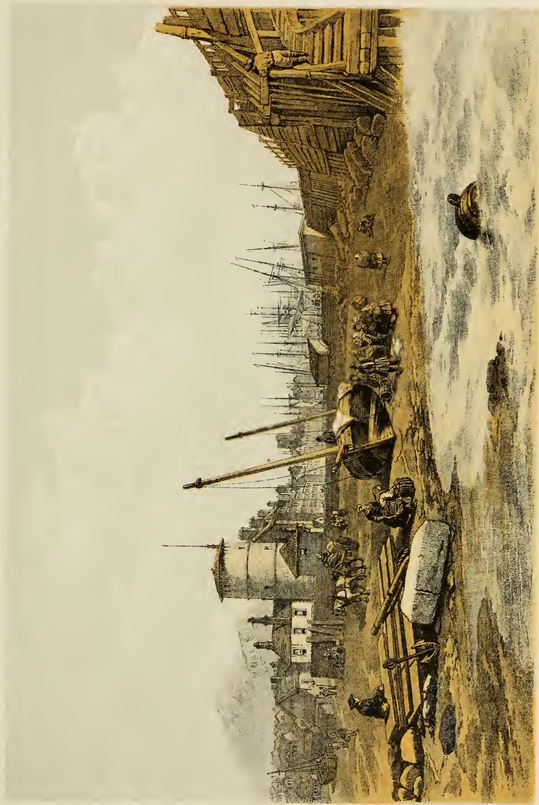
THE BACK OF OLD LEBETH PIER

from a Daguerre Photograph by C. Stansfeld, R.S.