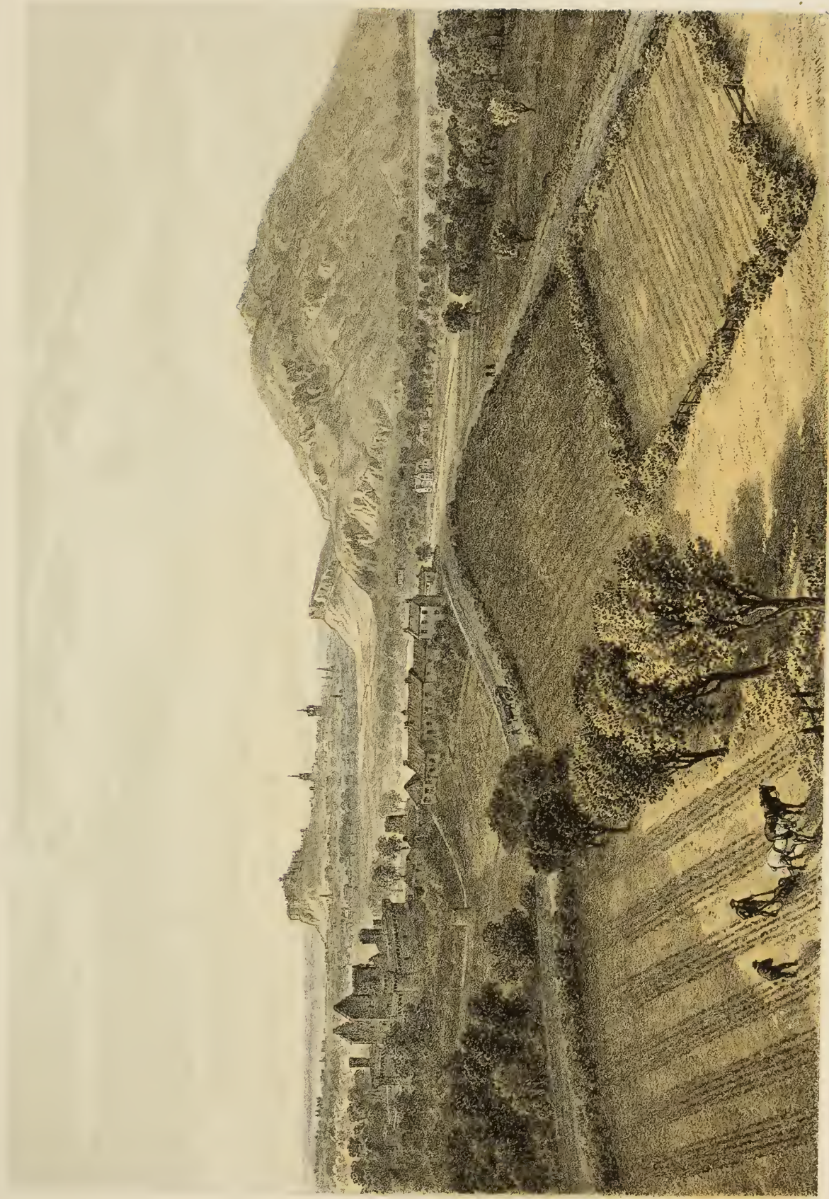
EDINBURGH FROM NEAR CRAIGMILLAR CASTLE.