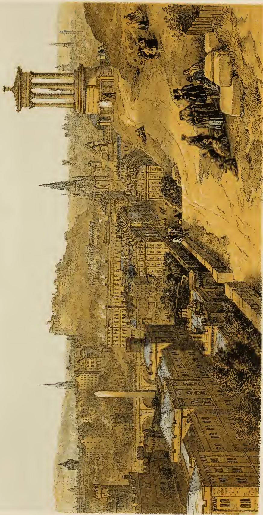
EDINBURGH FROM THE CALTON HILL.