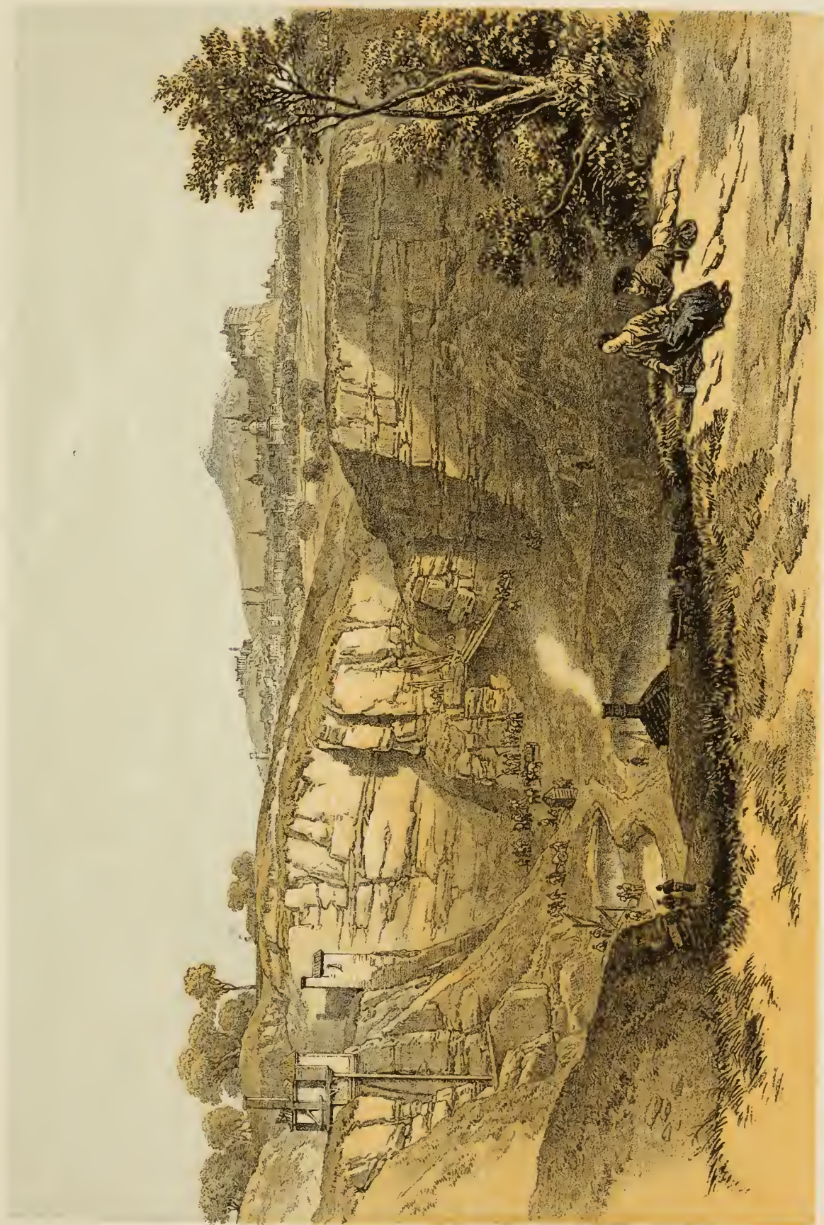
EDINBURGH, FROM CRAIGLEITH QUARRY.