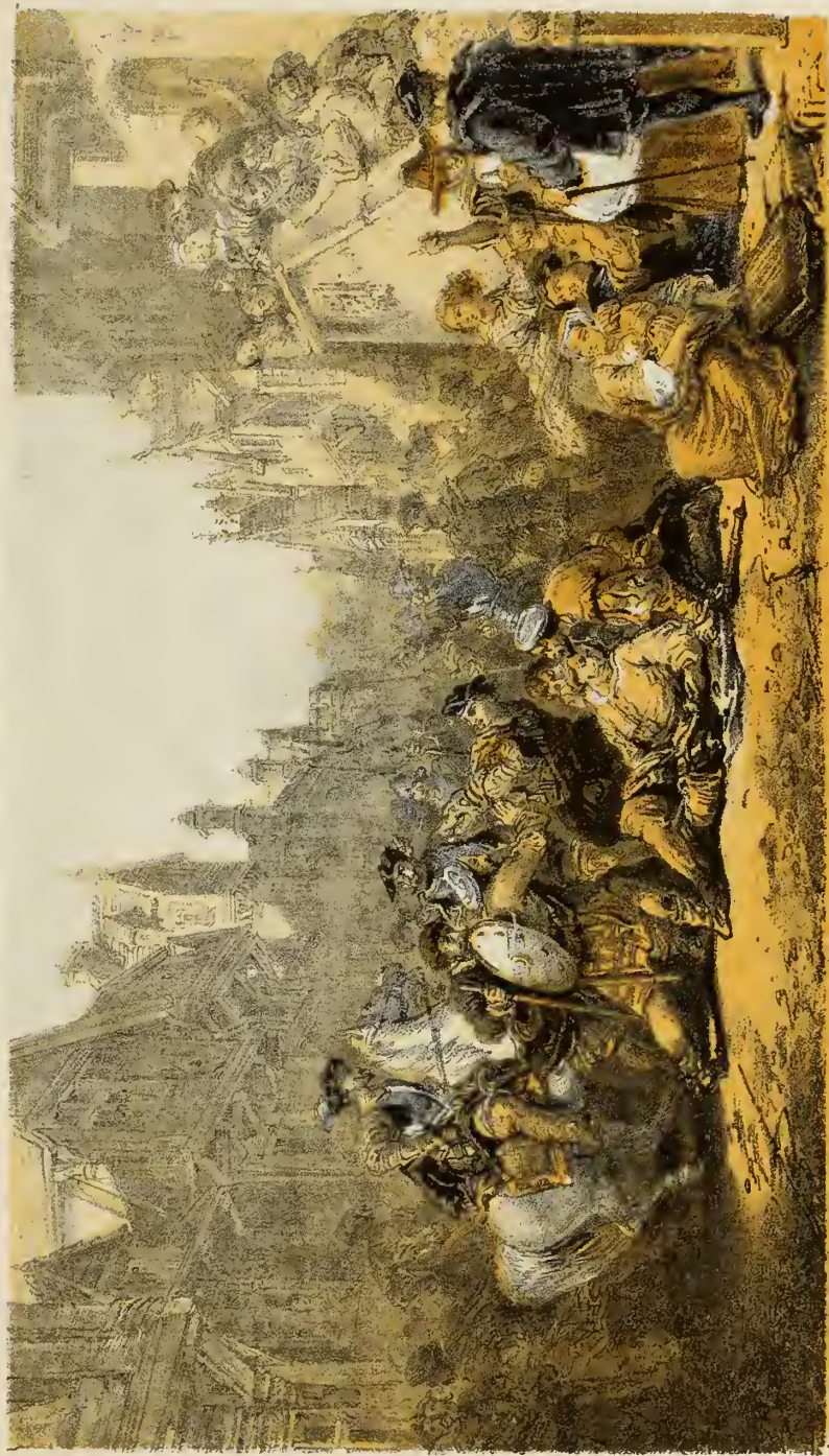
OLD MILLTENGOW, (ASSASSINATION OF KING GEORGE III.)

From an engraving by J. W. M. W. Turner.