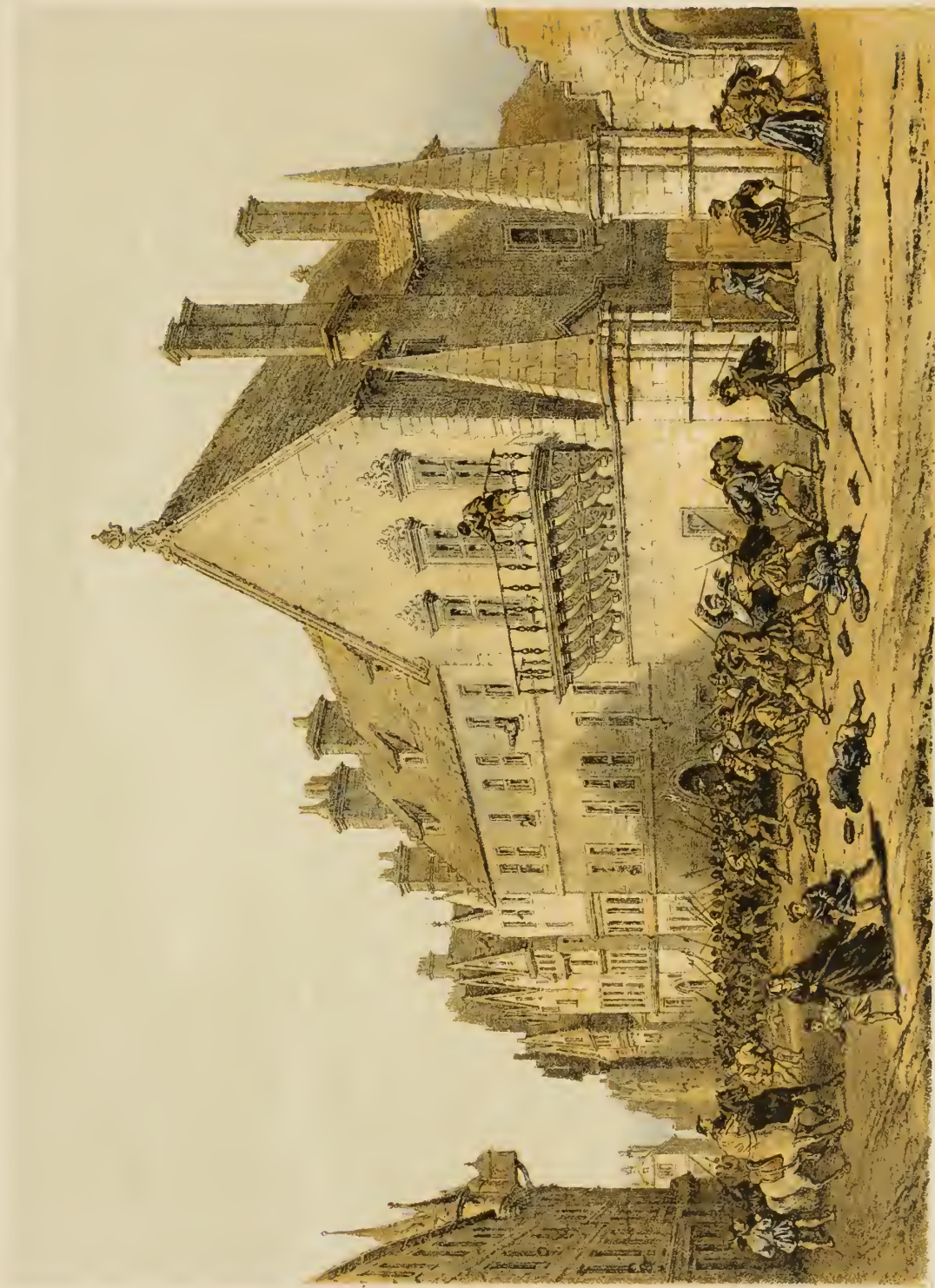
MURRAY HOUSE, CANNON GATE.