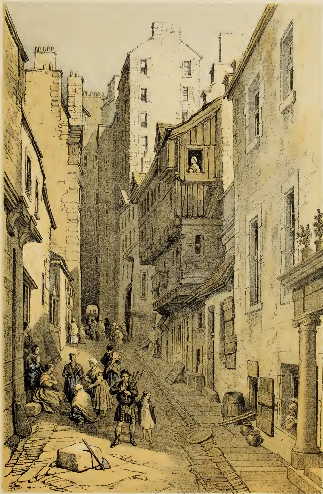
FLESHMARKET CLOSE. EDINBURGH.