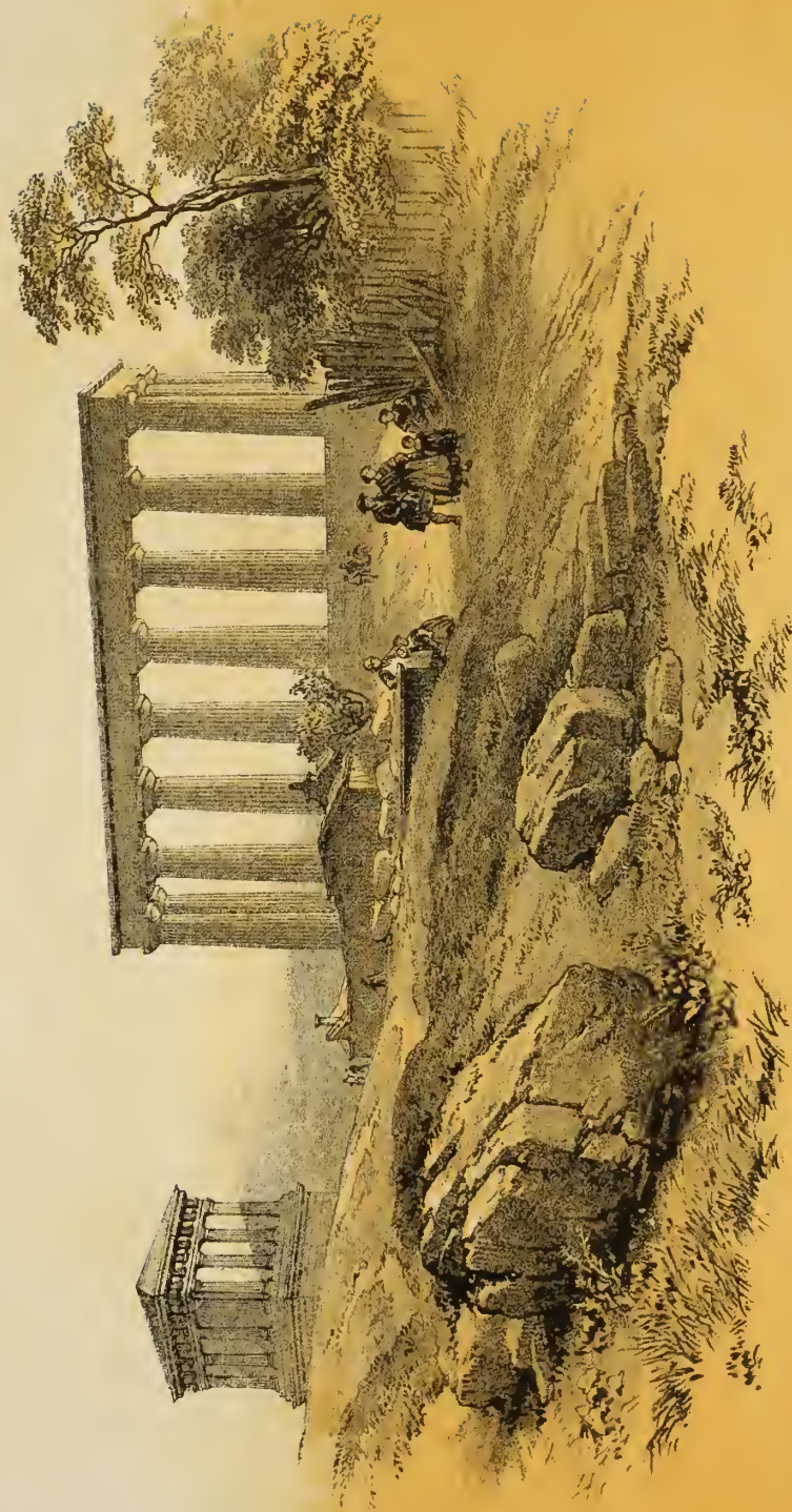
NATIONAL MONUMENT, CALTON HILL.