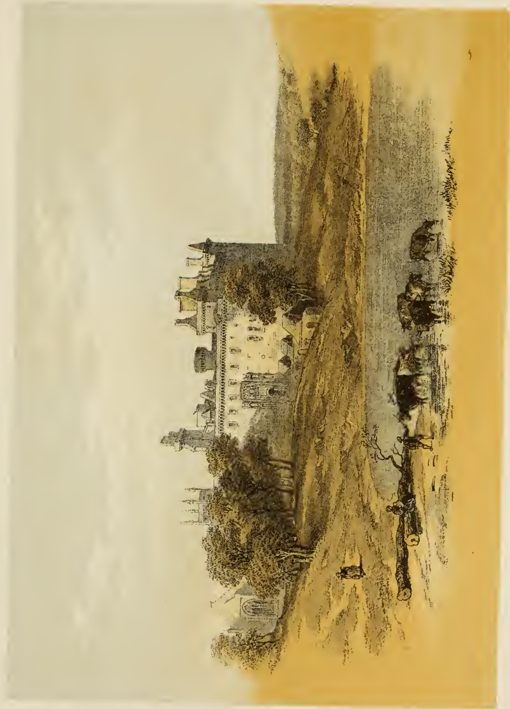
LINCOLN'S INN PALACE.