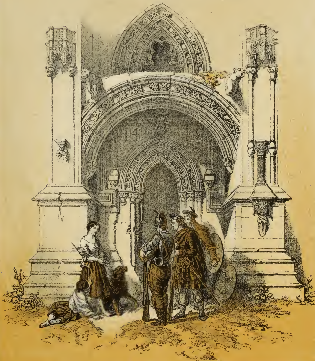
ENTRANCE TO ROSLIN CHAPEL.

From an Original Drawing by D. Roberts, R.A.