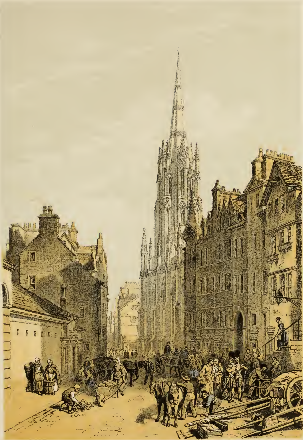
NEW ASSEMBLY HALL. EDINBURGH.