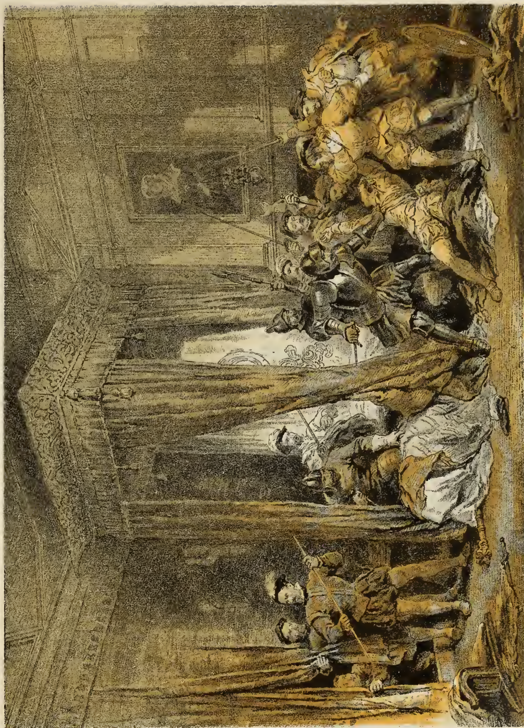
QUEEN MARY'S BED-CHAMBER, HOLYROOD.