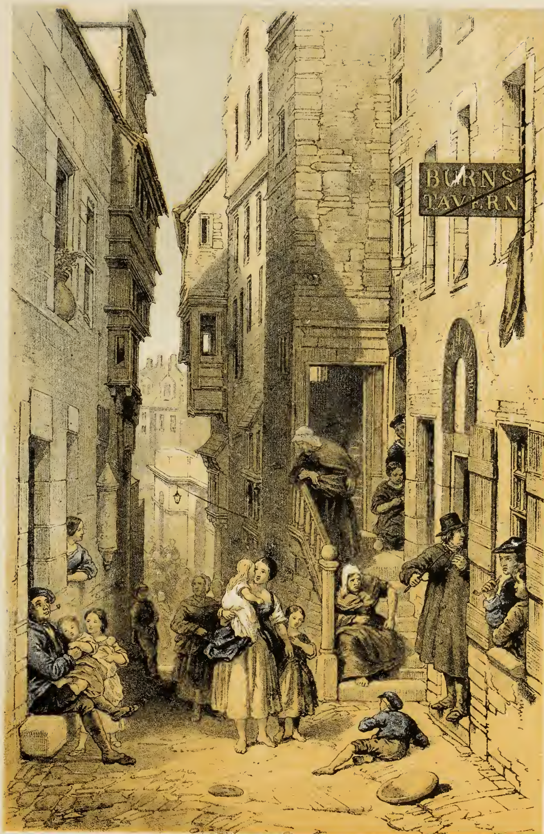
LIEBERTON'S WYND. EDINBURGH