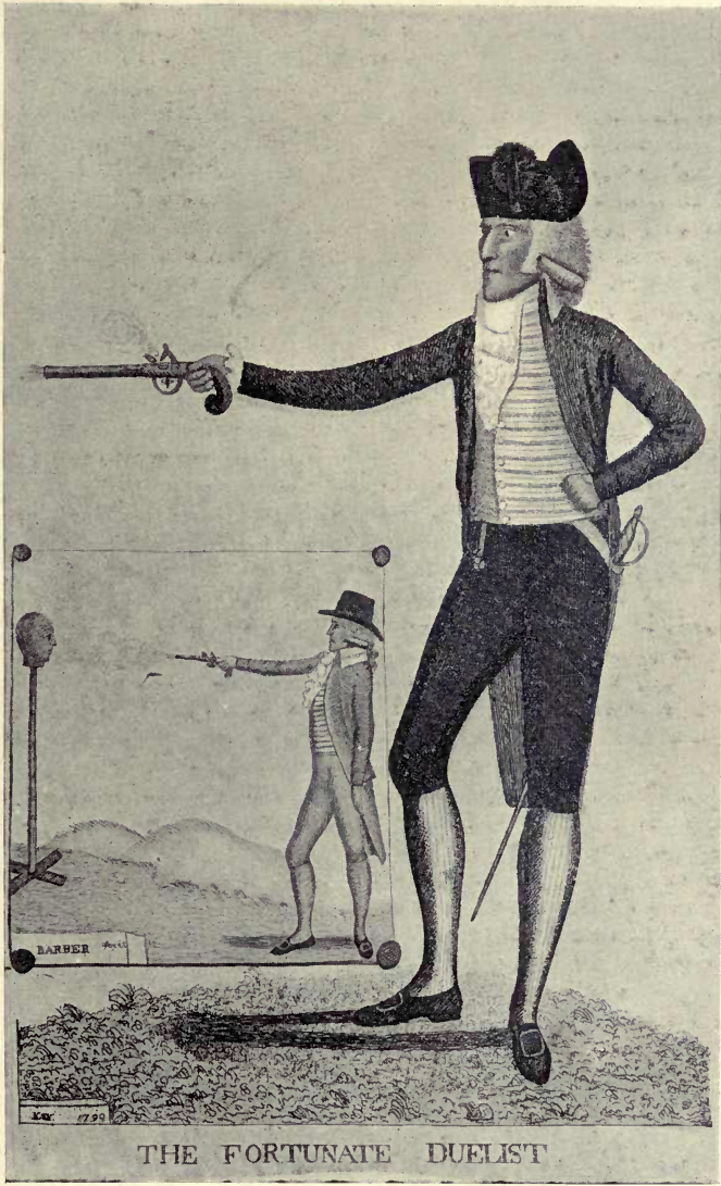
THE FORTUNATE DUELIST