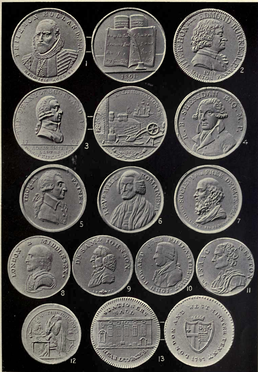
EIGHTEENTH CENTURY TOKENS.