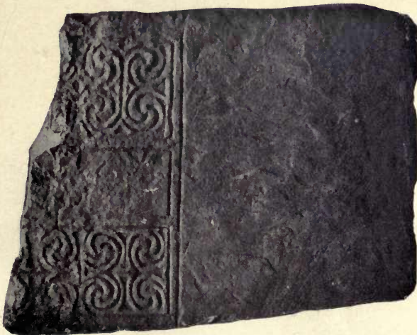
CELTIC CROSS-SLAB AT ST. ANDREWS Scale one-fourteenth