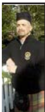
Pres. Ken Buchanan

http://www.theclanbuchanan.com/html/contact.html