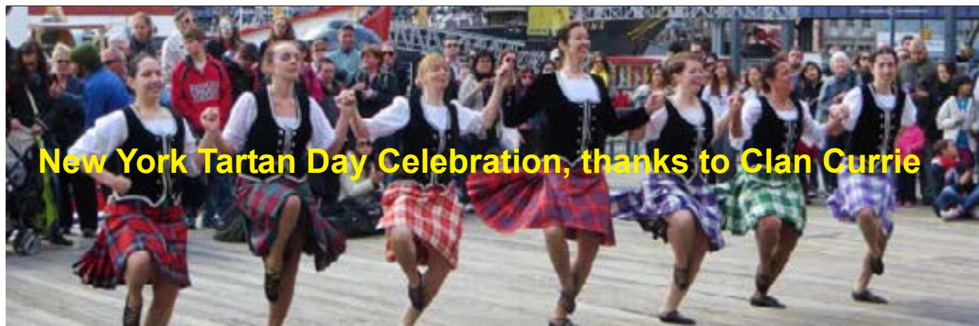
New York Tartan Day Celebration, thanks to Clan Currie