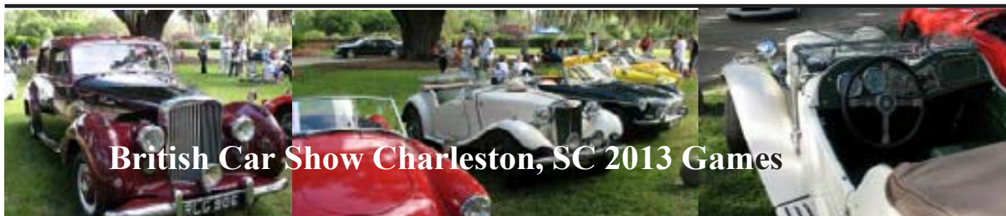
British Car Show Charleston, SC 2013 Games