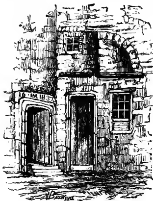
REMAINS OF ST. ANTHONY'S MONASTERY.

ture which remains, consisting of the doorways and part of an arch, is represented in the accompanying engraving.