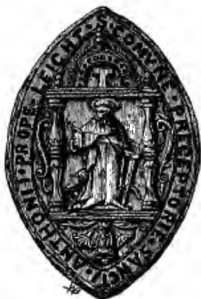
ST. ANTHONY'S SEAL.

On the common seal of the monastery St. Anthony appeared under a canopy in a hermit's gown, and having at his right foot a wild pig with a bell on its neck. On the circumfer-