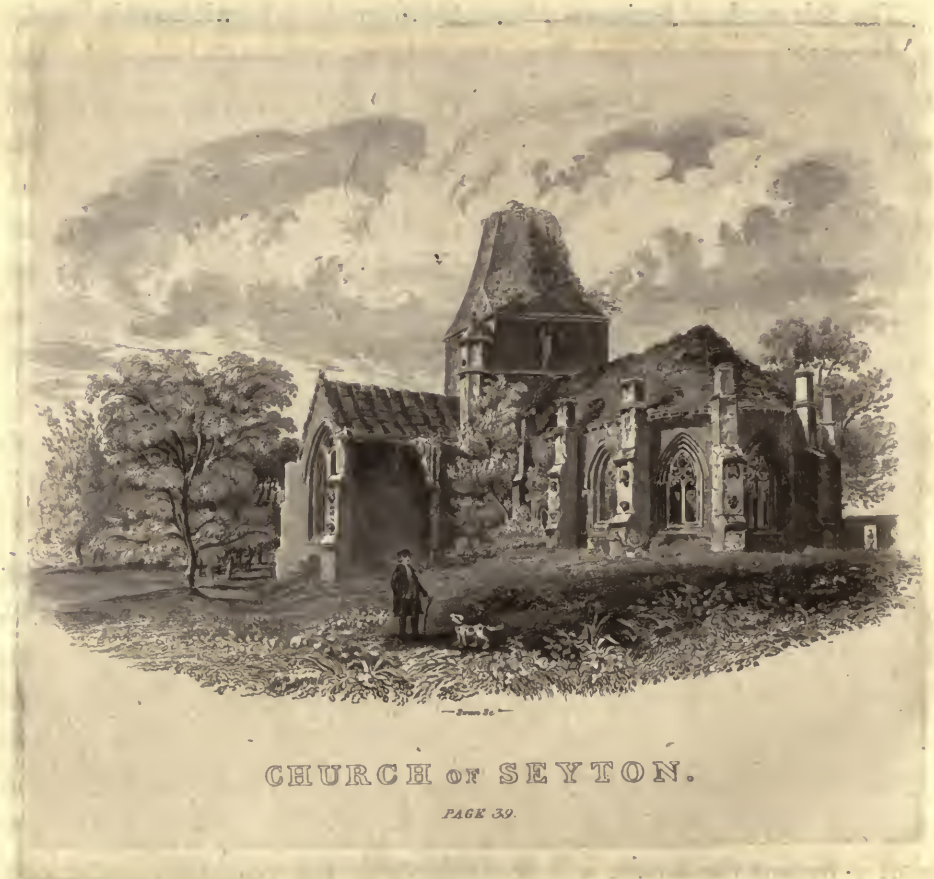
CHURCH OF SEYTON.

famyn ; I fall fet furth sic doingis done be him als larglie and weill extendit till his dispraysse as I haue done in ony thing befor said to his loving, he nocht amendand and redressand the famyn in his lyftyme, gif God fortounis me to leiff and be hable thairto. Bot I pray God, that the said Lord fall nocht in sic inconuenientis, to-gif me, or ony man, occasioun to wryt ocht of him bot honorable.