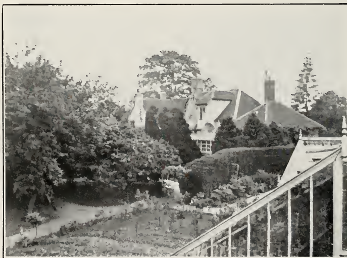
HOT-HOUSES AND GARDEN.