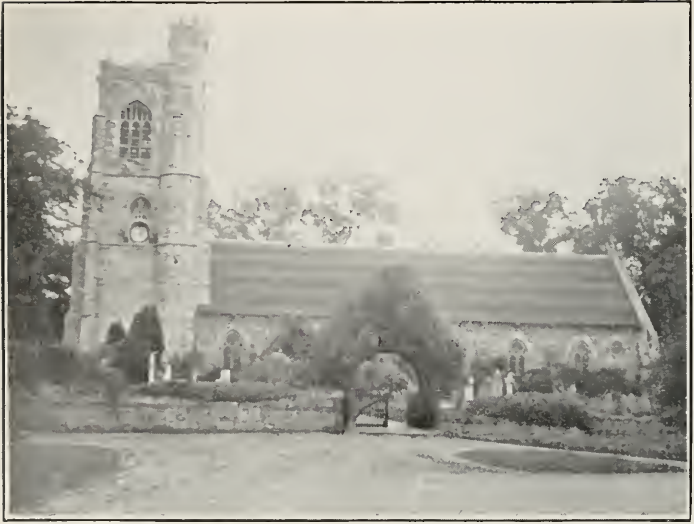
ST. PETER'S CHURCH.