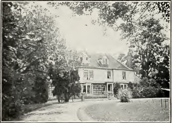
DRIVEWAY AND FRONT OF HOUSE.

There is also the Manor House, with its broad moat. It is evident that the old family of Wrights was then living in Brook Street—doubtless in the Moat House. They