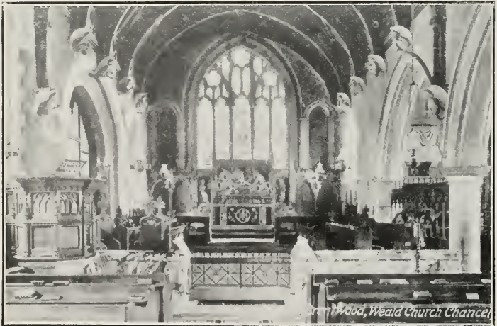
ALTAR IN ST. PETER'S CHURCH.