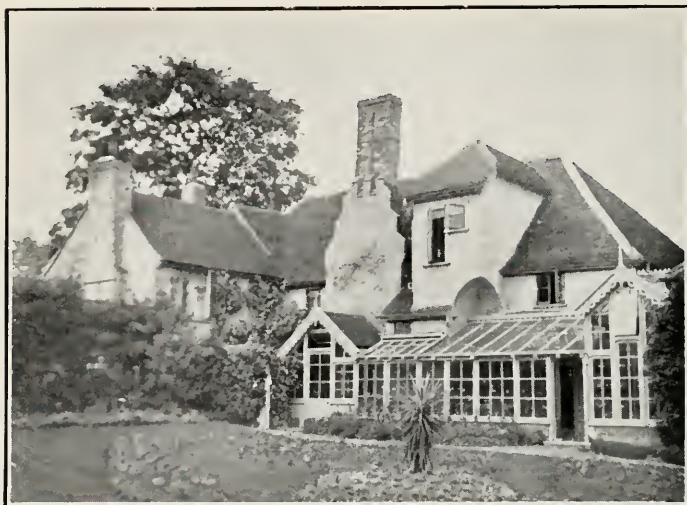
CONSERVATORY AND CHIMNEY BUILT ABOUT 1500.