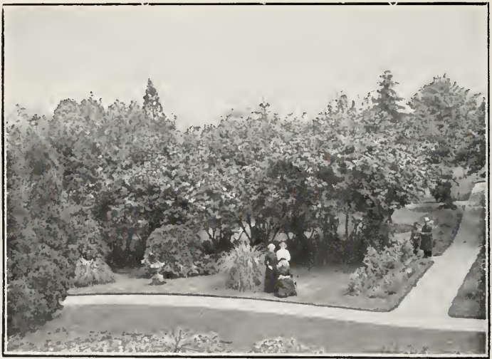
ROSE GARDEN, FROM WINDOW ON LANDING.

The house is built of brick, painted yellow; two stories, with the upper overhanging the lower. Two dormer windows are in the roof, which is covered with flat tile. Three bay-windows adorn the front with lattice work between on which vines are growing. A small porch over the front door, supported by one pillar on each side, is very quaint. A very beautiful old-fashioned brass knocker ornaments the front door.