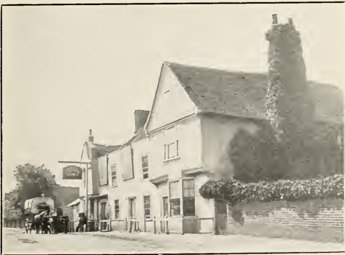
BROOK STREET WITH INN.

Brook Street is perhaps the oldest part of the parish: it takes its name from the two little rivulets, which, rising in the sandy hill above, and forming a junction at its bottom, flow into the small river of the Ingrebourne.