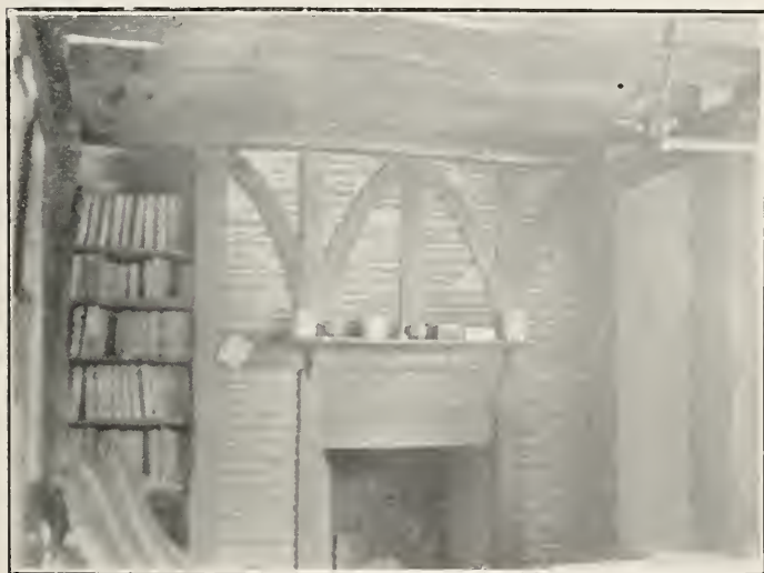
CORNER OF LIBRARY.

Just back of the library are the two kitchens, which appear to be very ancient, with a large open fire-place and brick oven, formerly used for cooking.