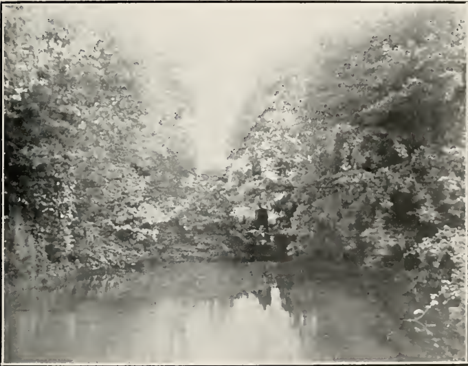
PART OF MOAT BACK OF HOUSE.

The portion of the moat remaining is situated a short distance from the rear of the house and this bit is very picturesque, with the reflection of the trees and sky on the surface of its water. This house with its moat and