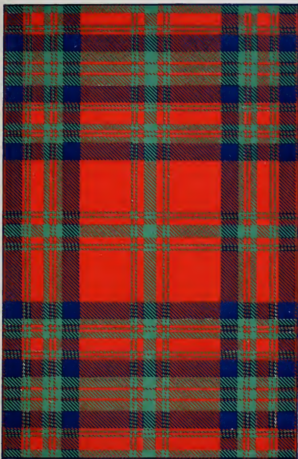
CLAN MATHESON TARTAN