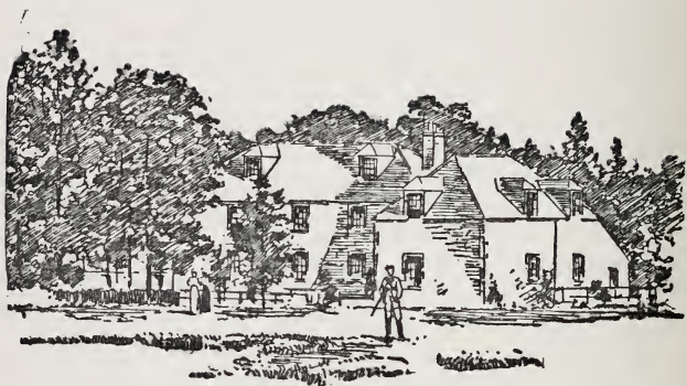
OLD ATTADALE HOUSE.