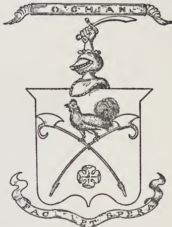
ARMS OF THE MATHESONS OF BENNETSFIELD.