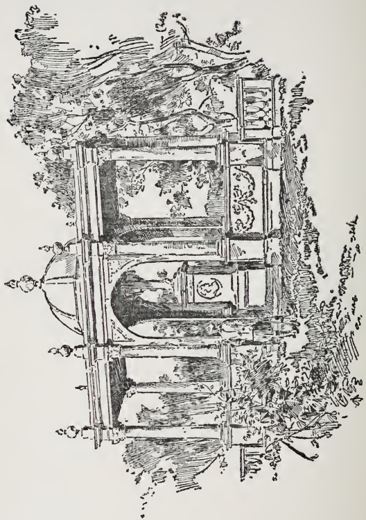
Tomb of Sir James Matheson, Bart., at Lairg.